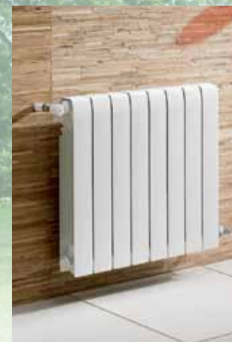
Designer High Output Radiators