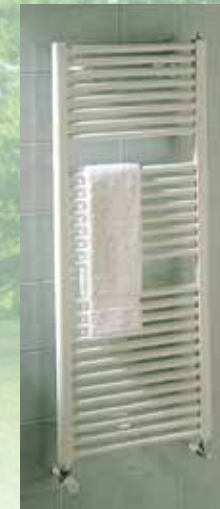
Heated Towel Warmers