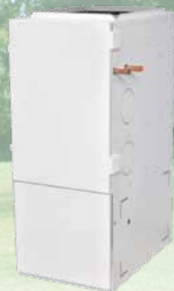
Hydronic Air Handler