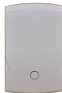
Baxi 4-to-1 Multi-Zone Controller (MLC 30B) can manage up to four non-mixed zones, each with its own thermostat