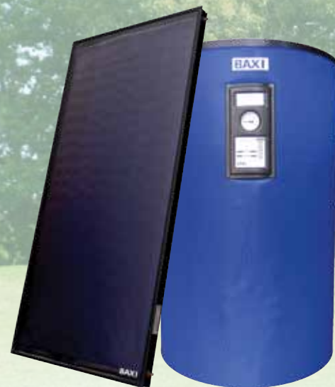
Solar Water Heating with Indirect Storage Tanks