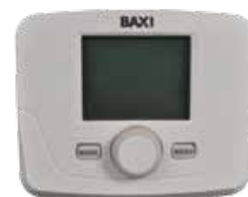
Baxi Remote RC Modulating Controller operates as a room thermostat and enables remote review of boiler information and setting of parameters