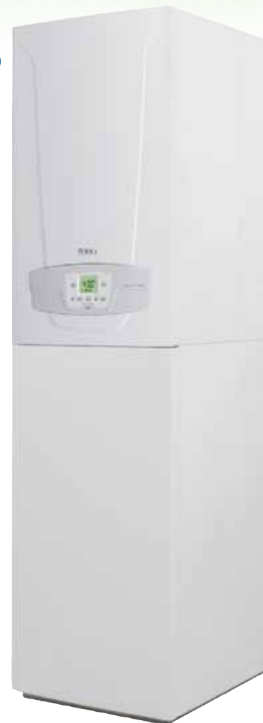
The Modulo is a sleek and compact combination system that features a Baxi Luna Duo-Tec 1.33 GA heating-only boiler atop a 21-gallon (US) stainless steel, insulated storage tank. It produces 145 gallons of domestic hot water in half an hour.