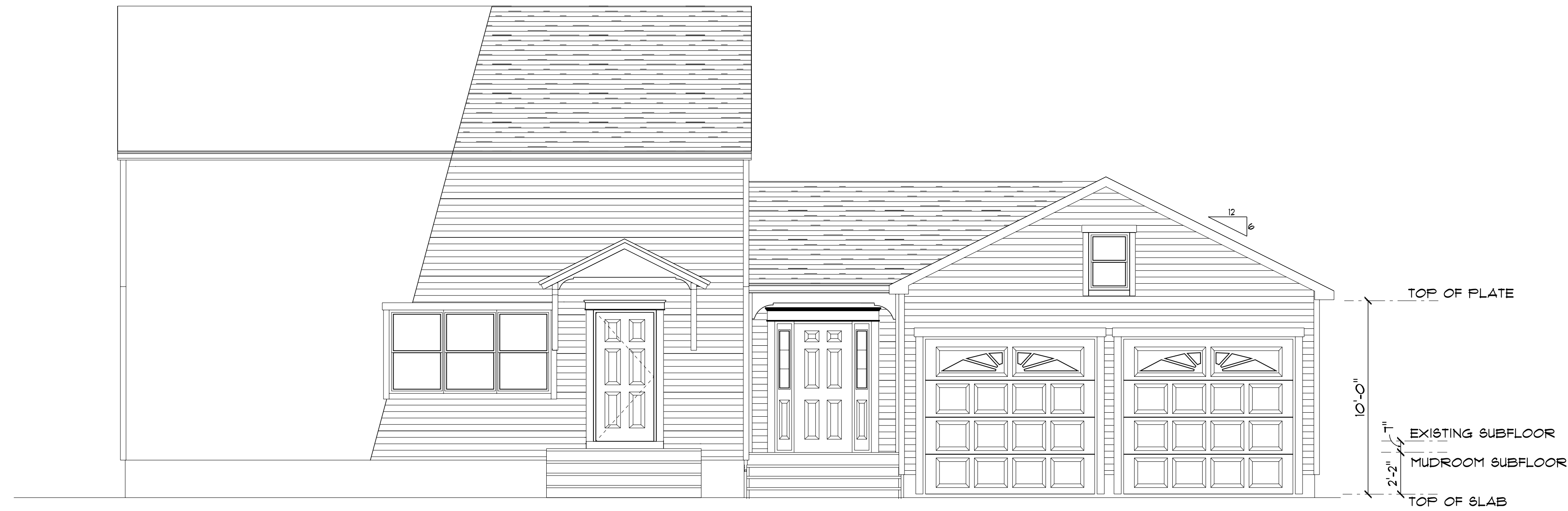
FRONT ELEVATION B SCALE: 1/4" = 1'-0"