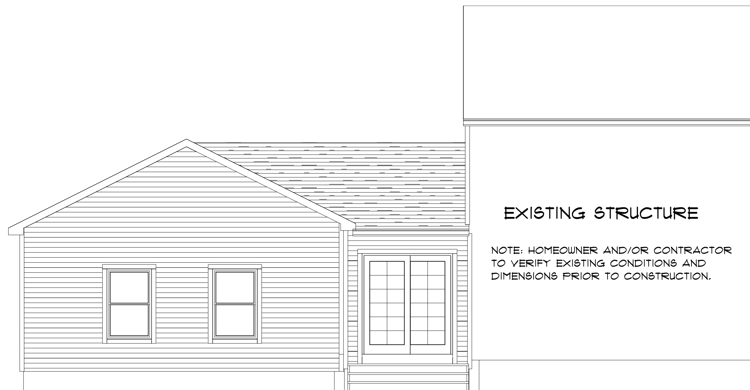
REAR ELEVATION B SCALE: 1/4" = 1'-0"