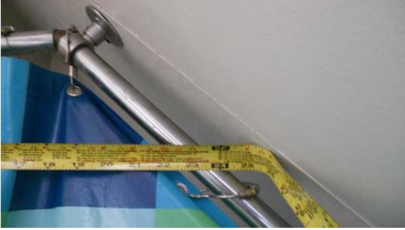
052 Third Floor Headroom.JPG