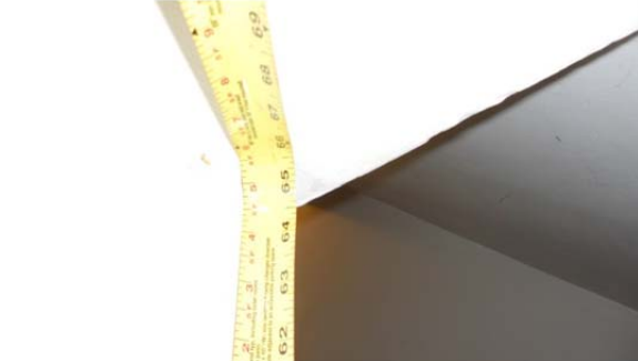
021 Second Floor Stair Headroom.JPG