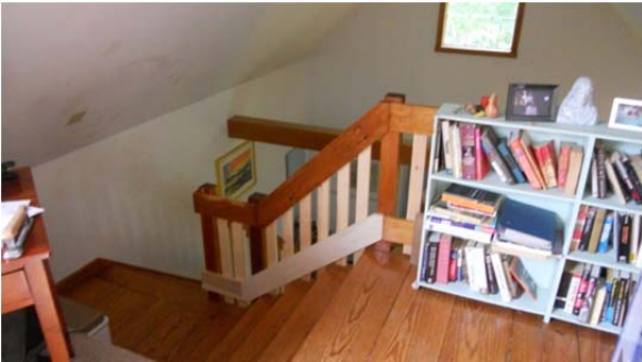
030 Rear Interior Stair.JPG