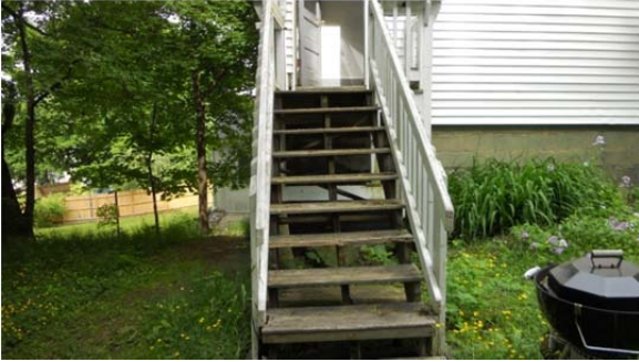
070 Rear Exterior Stair.JPG