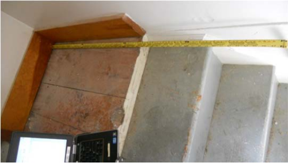
040 Rear Common Stair.JPG