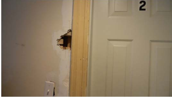
012 Front Stair.JPG