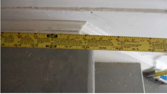
042 Rear Common Stair.JPG