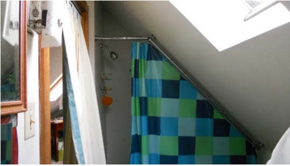
050 Third Floor Headroom.JPG