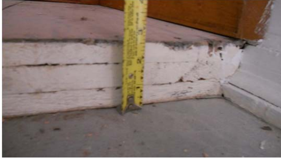
043 Rear Common Stair.JPG