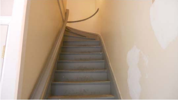
010 Front Stair.JPG