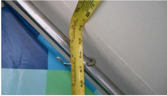
051 Third Floor Headroom.JPG