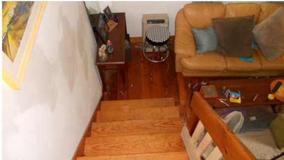
031 Rear Interior Stair.JPG