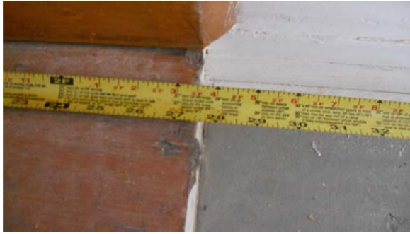
041 Rear Common Stair.JPG