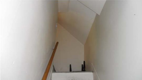
020 Second Floor Stair.JPG