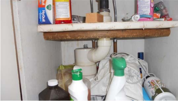
060 Plumbing Not to Code.JPG