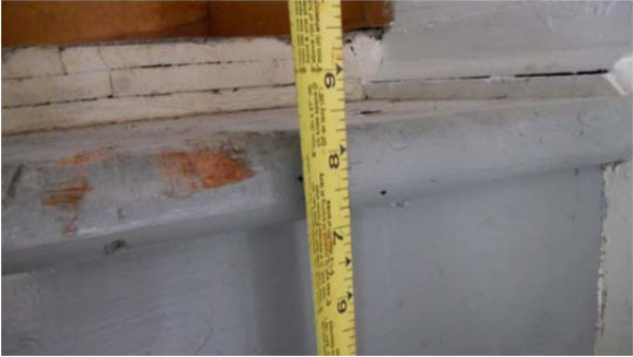
044 Rear Common Stair.JPG