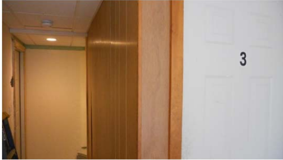
045 Rear Common Stair.JPG