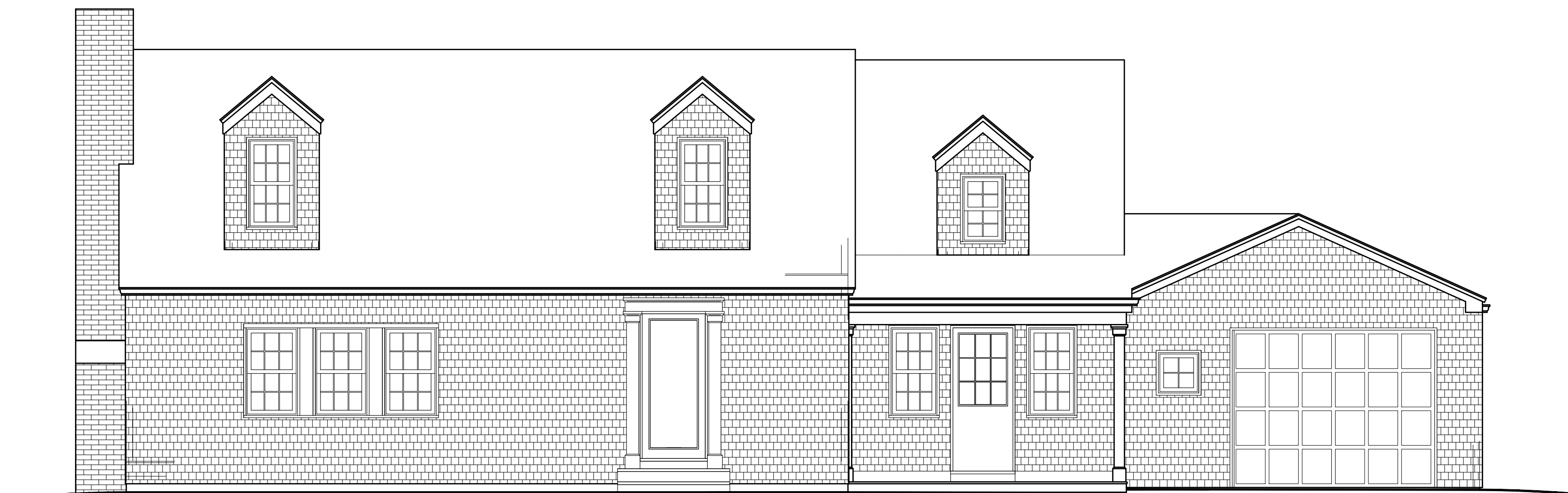
Main Elevation Scale: 1/4" = 1'-0"