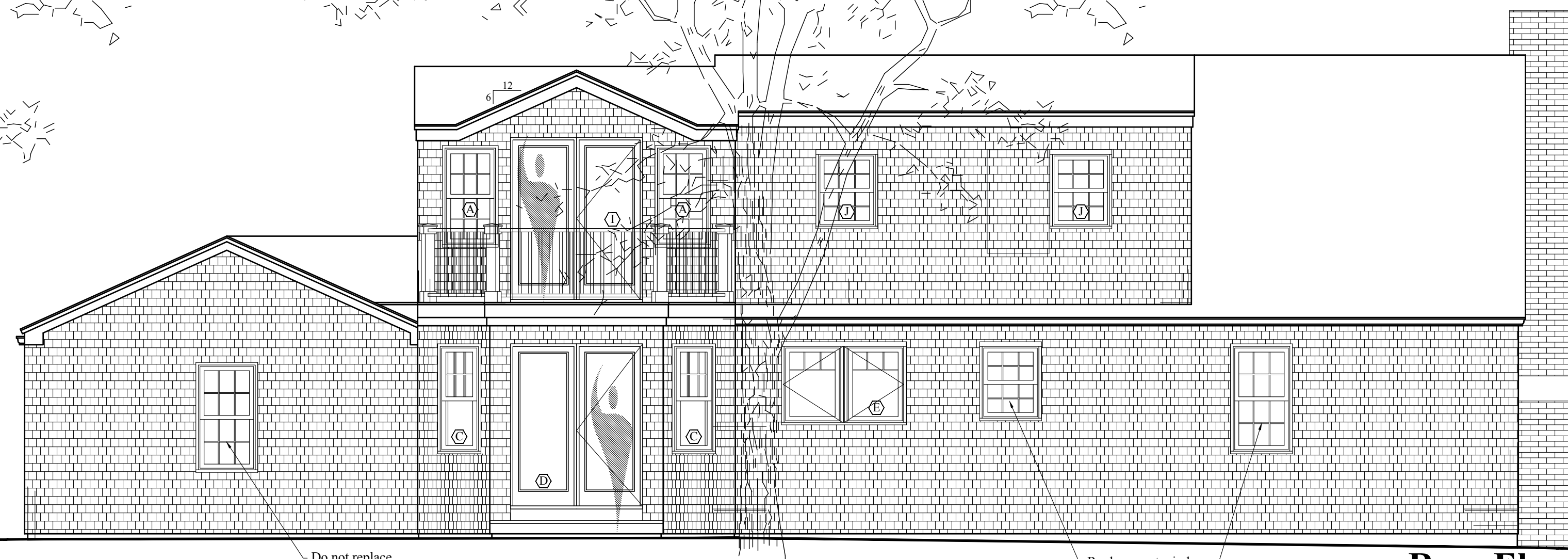
Rear Elevation Scale: 1/4" = 1'-0"