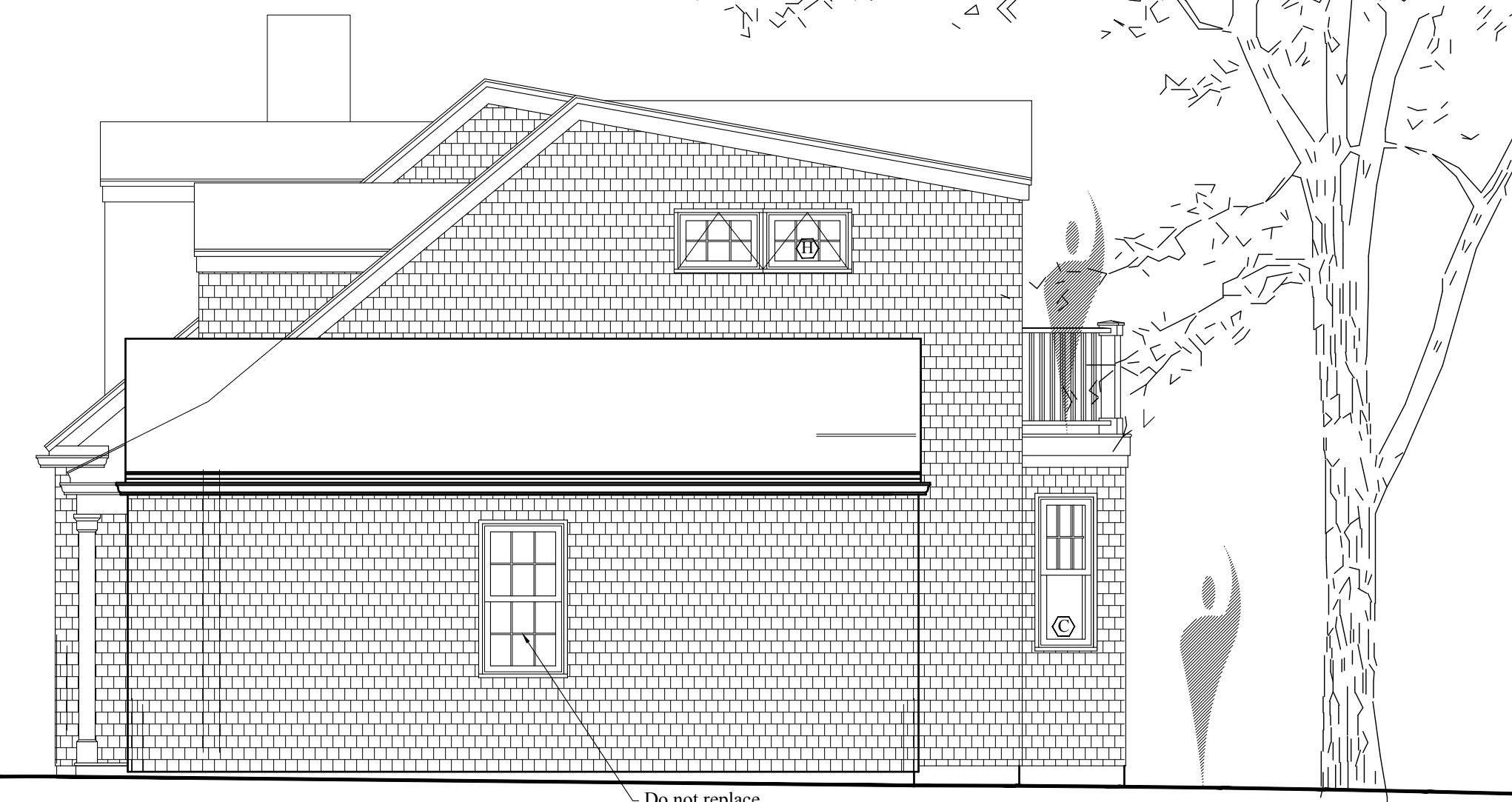
Right Elevation Scale: 1/4" = 1'-0"