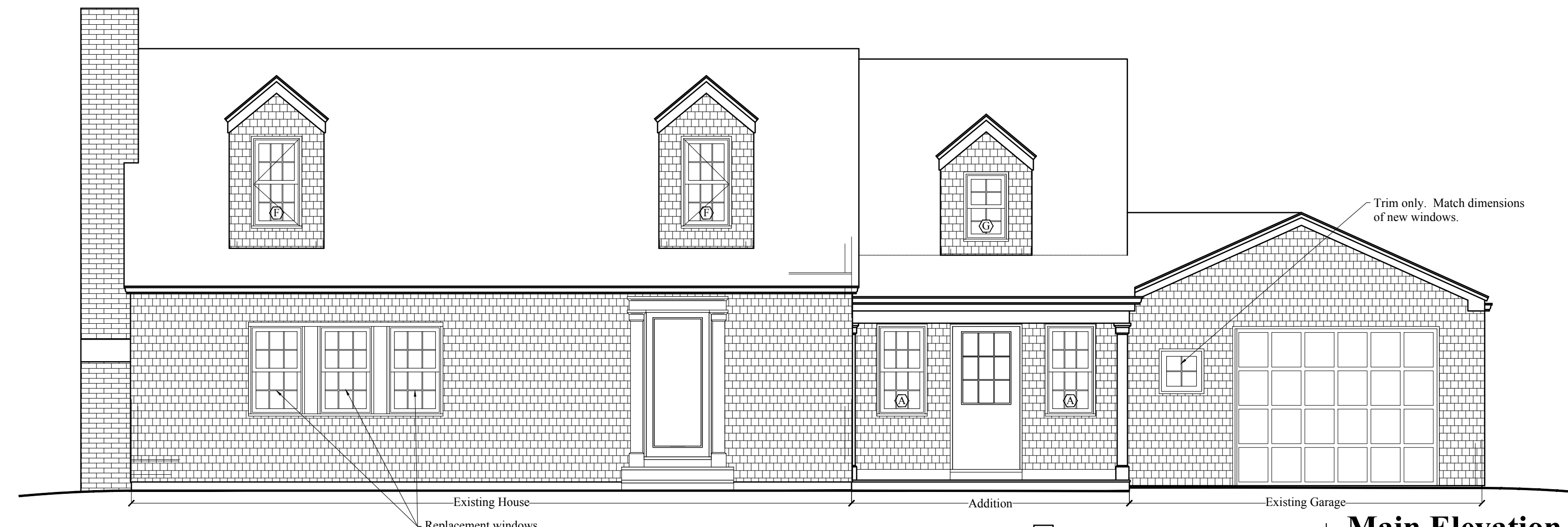
Main Elevation Scale: 1/4" = 1'-0"