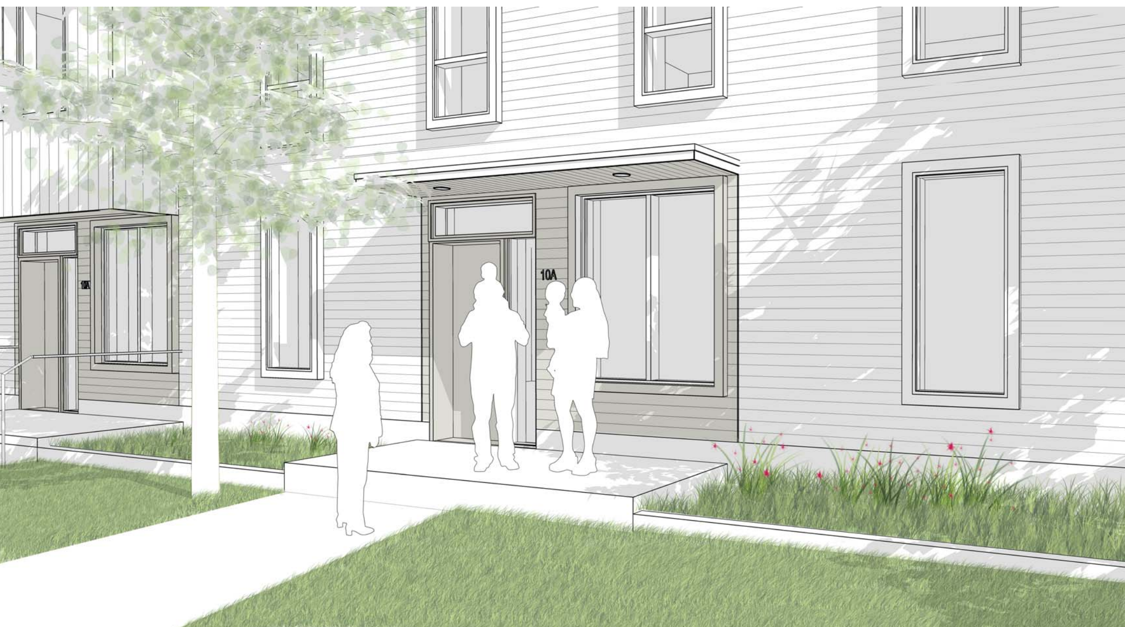
3 PERSPECTIVE VIEW - UNIT PATIO