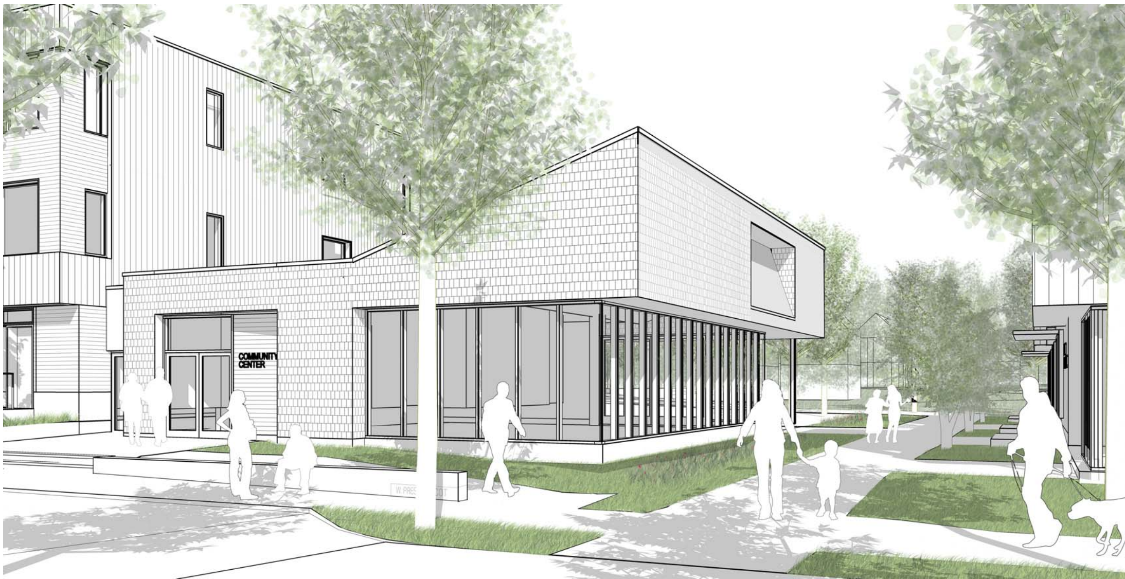
4 PERSPECTIVE VIEW - COMMUNITY BUILDING AT FRONT STREET