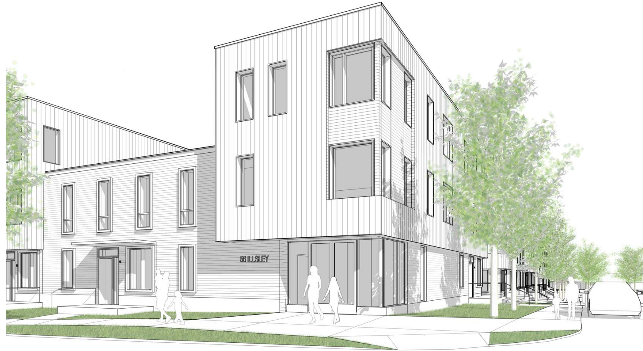
5 PERSPECTIVE VIEW - BUILDING 2 ENTRY