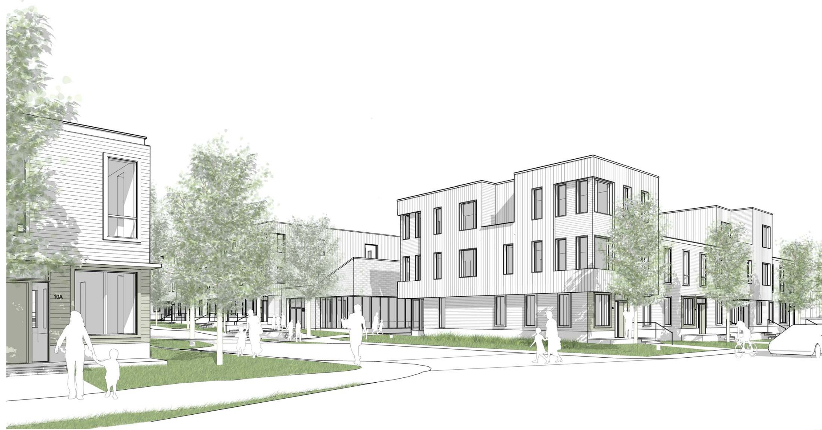
2 PERSPECTIVE VIEW - W. PRESUMPCOTT AT FRONT STREET 1/2" = 1'-0"