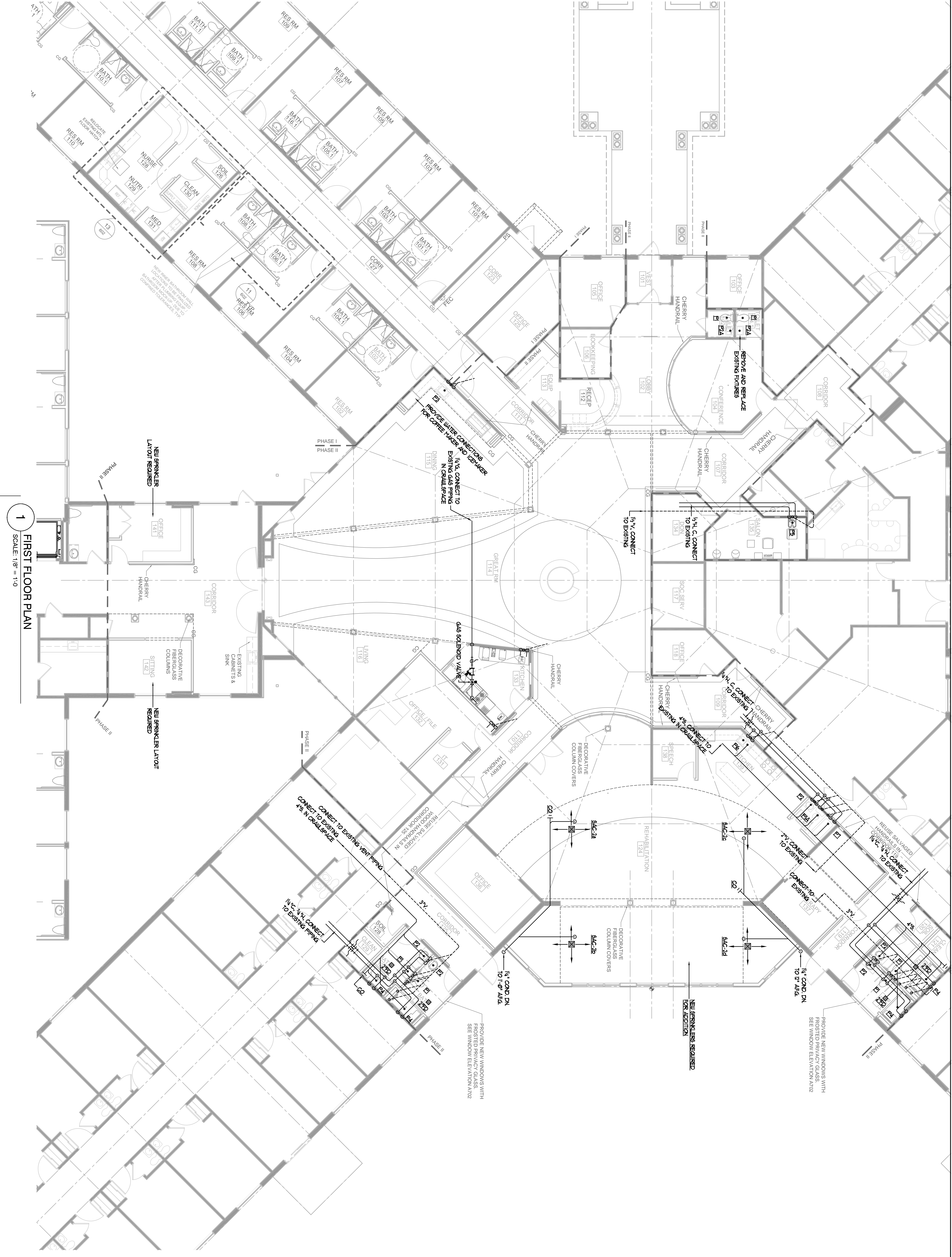
1 FIRST FLOOR PLAN SCALE: 1/8" = 1'-0"