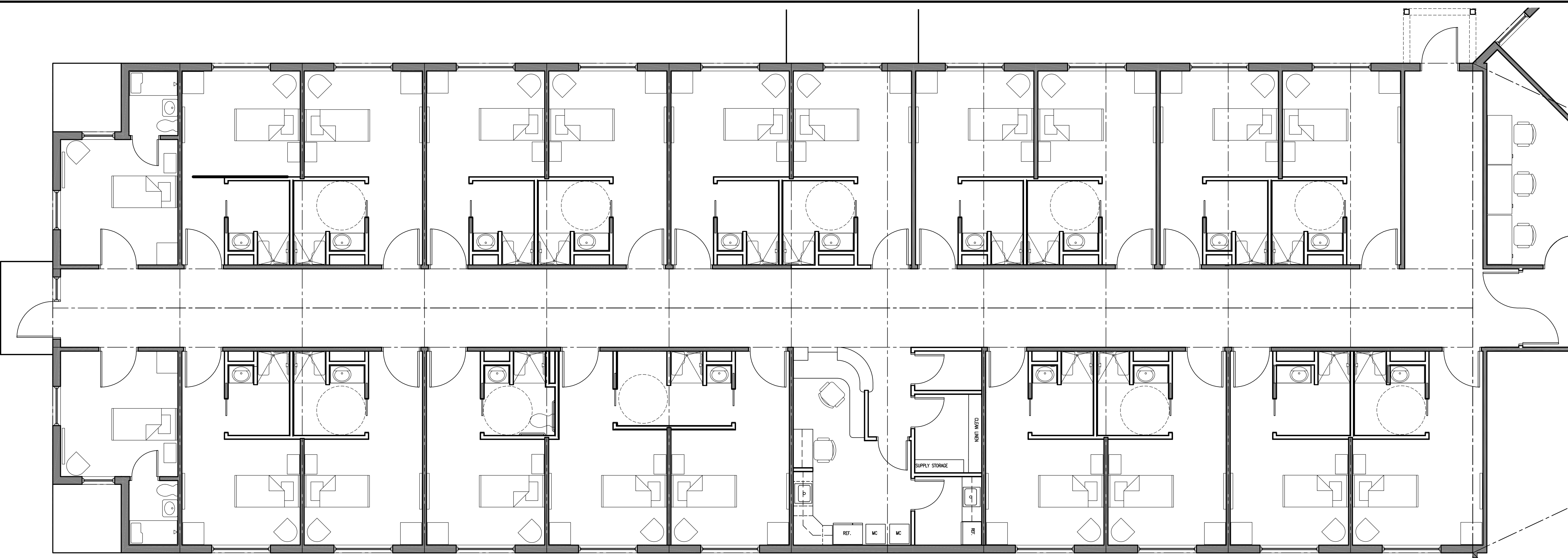
1 FURNISHINGS PLAN 3/16" = 1'-0"

FURNITURE PLAN PROVIDED FOR INFORMATION ONLY. FURNITURE AND MEDICAL EQUIPMENT NOT IN CONTRACT