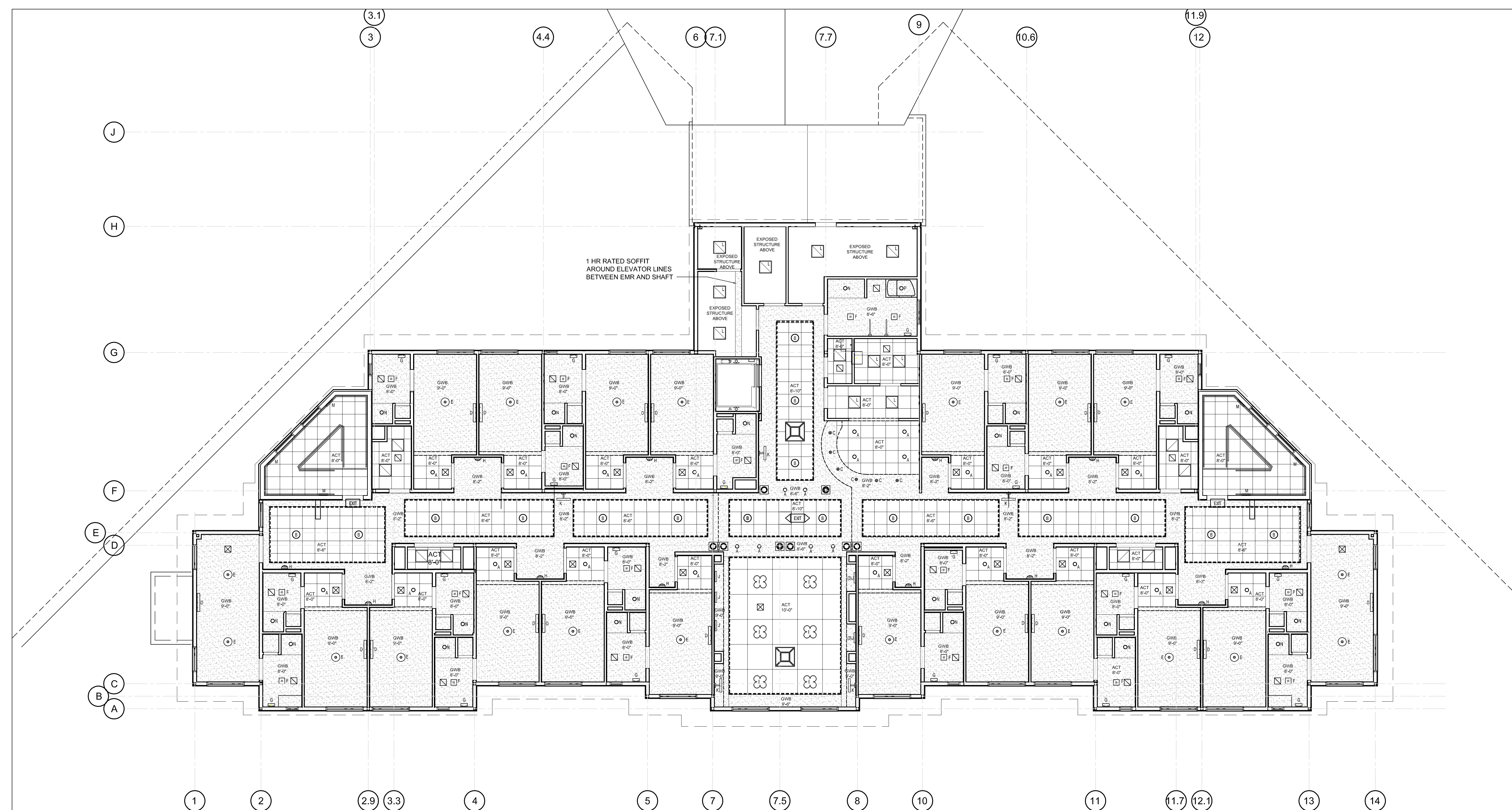
1 SECOND FLOOR RCP SCALE: 1/8" = 1'-0"