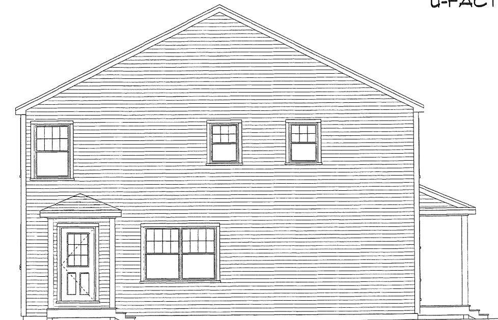
LEFT ELEVATION UNIT 1