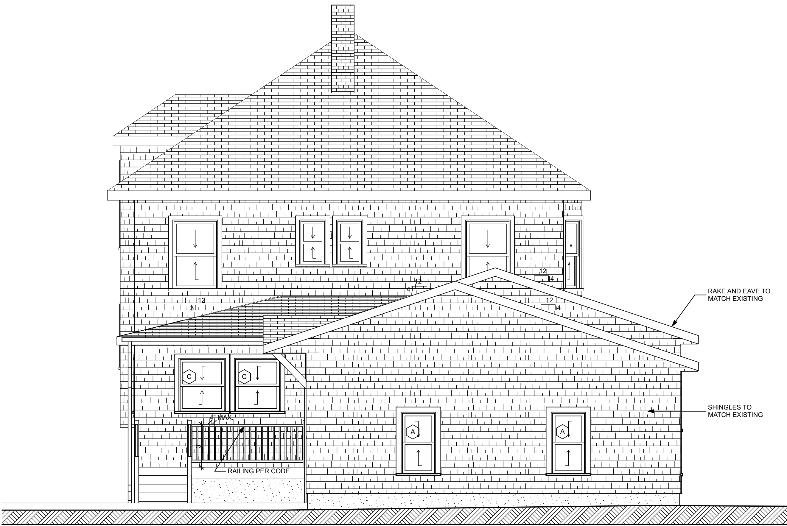
1 NORTH ELEVATION A2.2 SCALE: 1/4" = 1'-0"