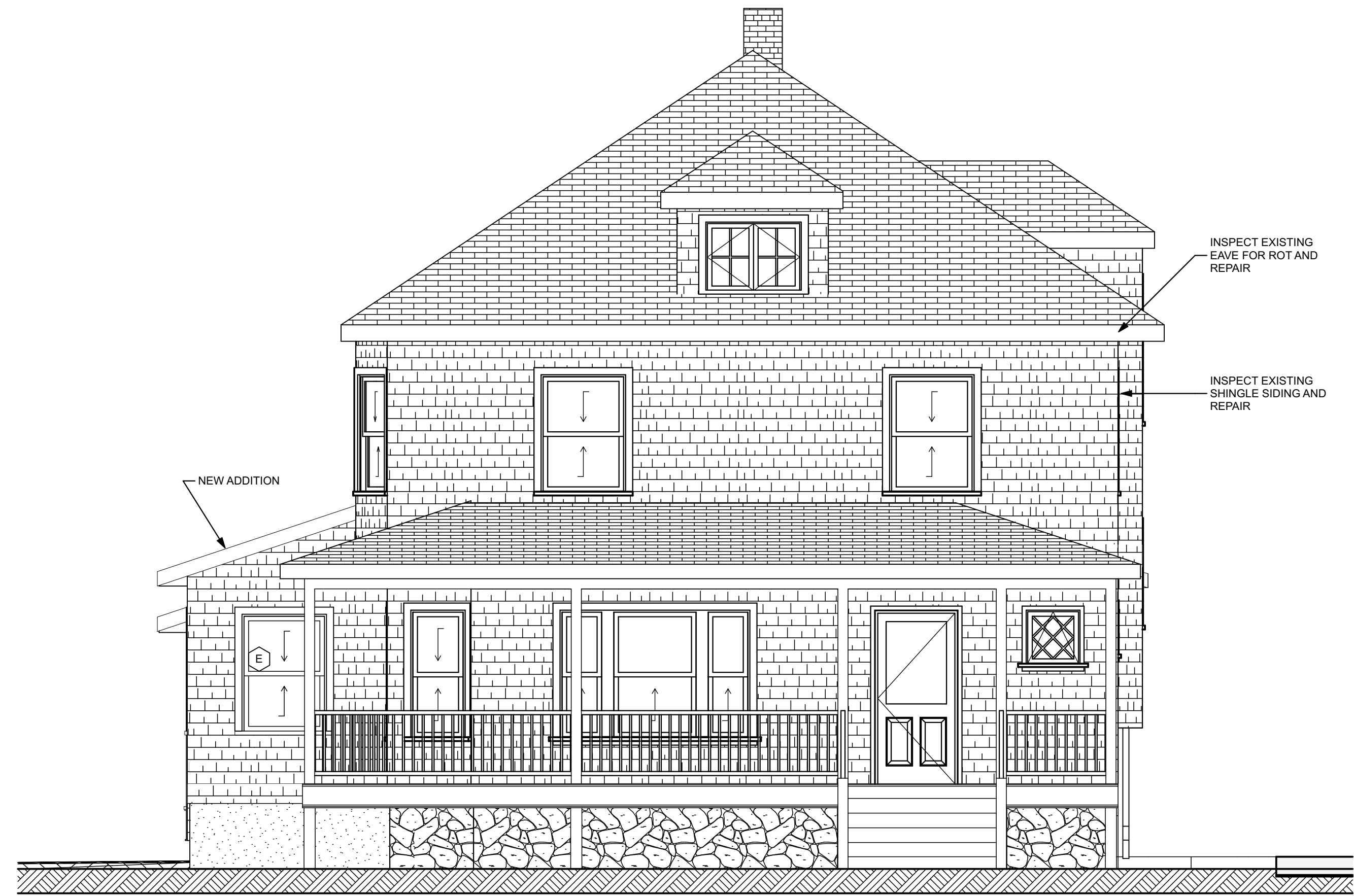
2 SOUTH ELEVATION A2.2 SCALE: 1/4" = 1'-0"

OCEAN AVE RESIDENCE ADDITION 524 OCEAN AVE PORTLAND, ME