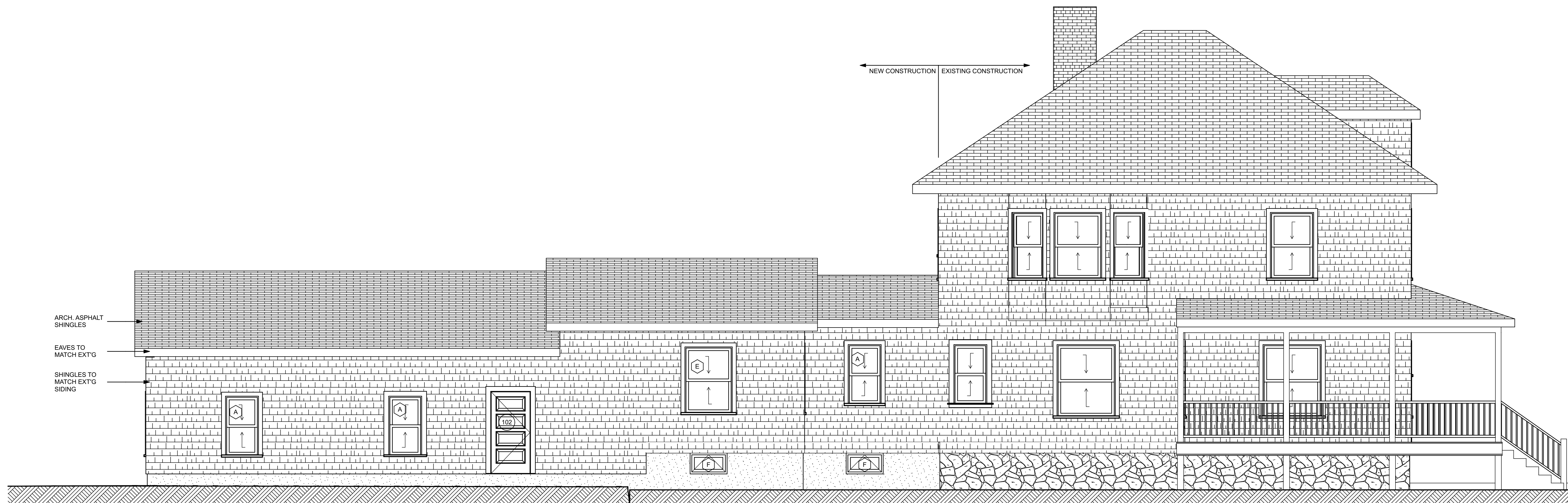
1 WEST ELEVATION A2.1 SCALE: 1/4" = 1'-0"