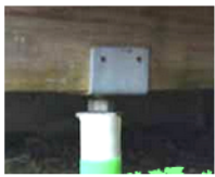
Metal attachment bracket from post top to subsill

UNDERSURFACE : 1/2" PT Plywood INSULATION : 10" Fiberglass batting (R-30) SUB-FLOOR : 3/4" AC Plywood FINISH FLOOR : Oak Flooring, narrow