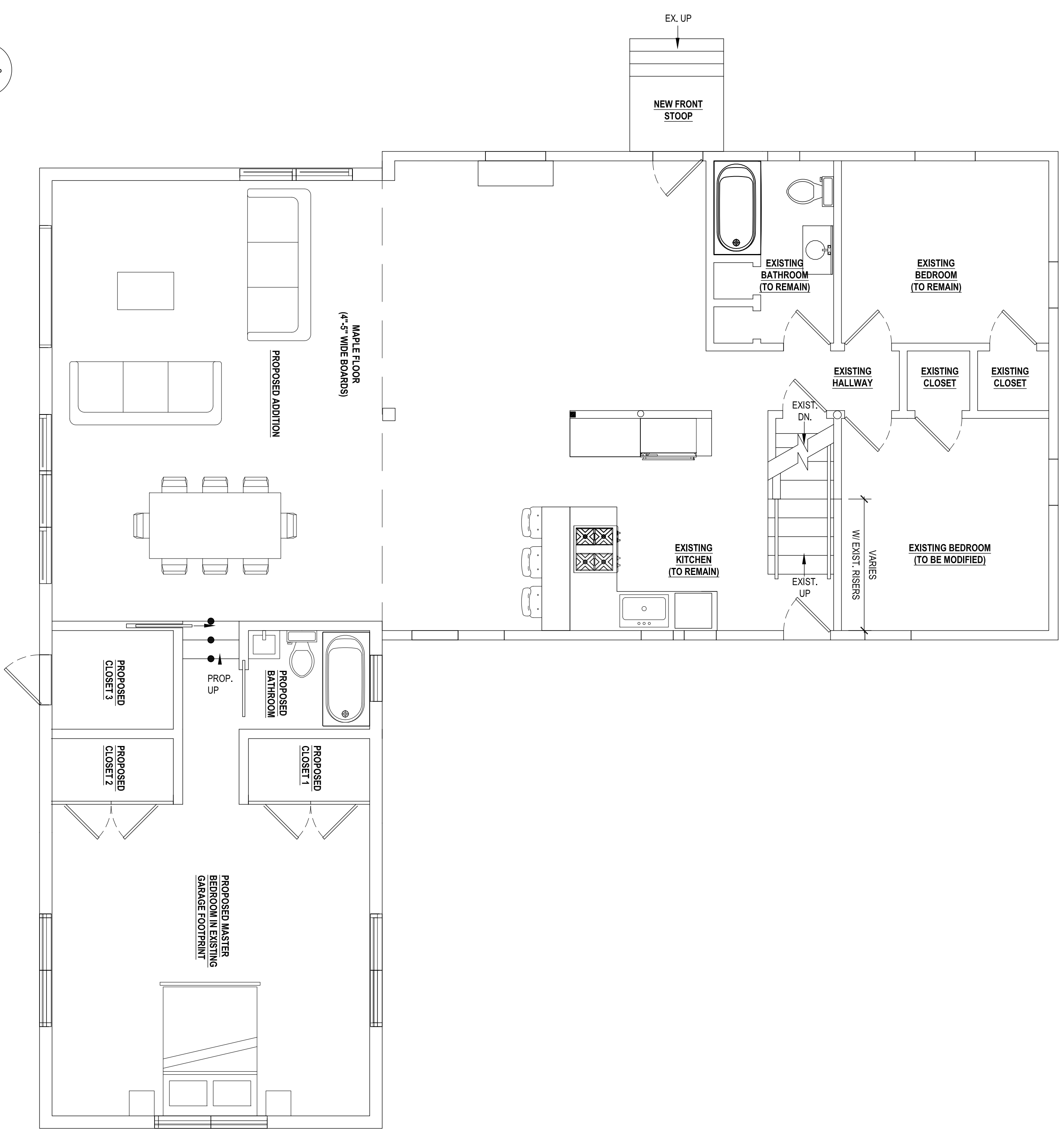
2 PROPOSED ADDITION / PLAN A1.0 SCALE 1/4" = 1'-0"