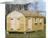
10x16 Cedar (with optional 26" door)