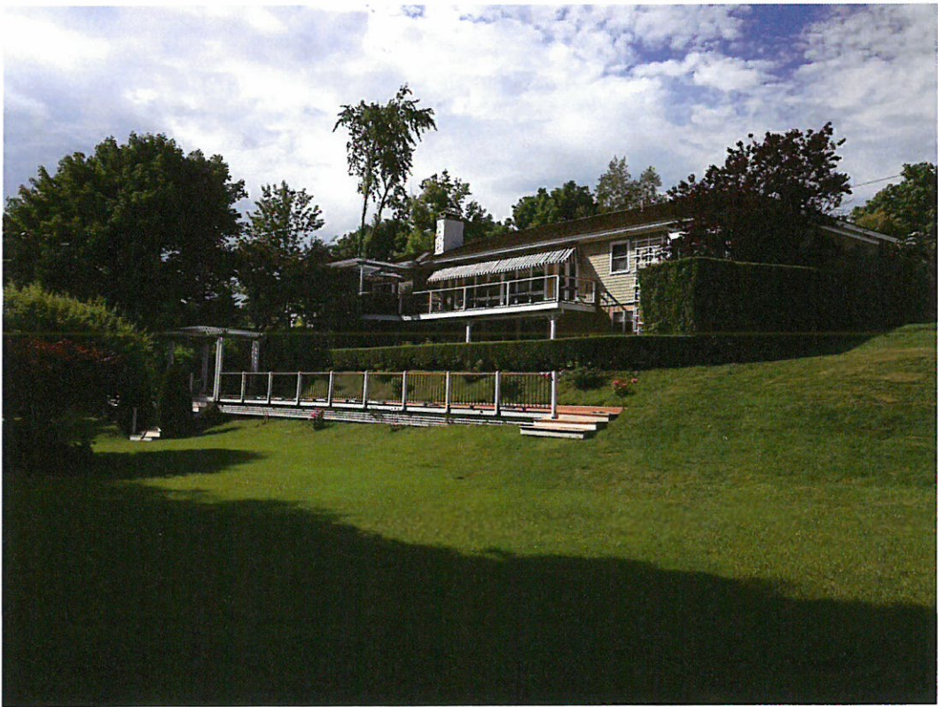
Ko Saribekian – 31 Brookside Road, Portland, Maine – June 2015