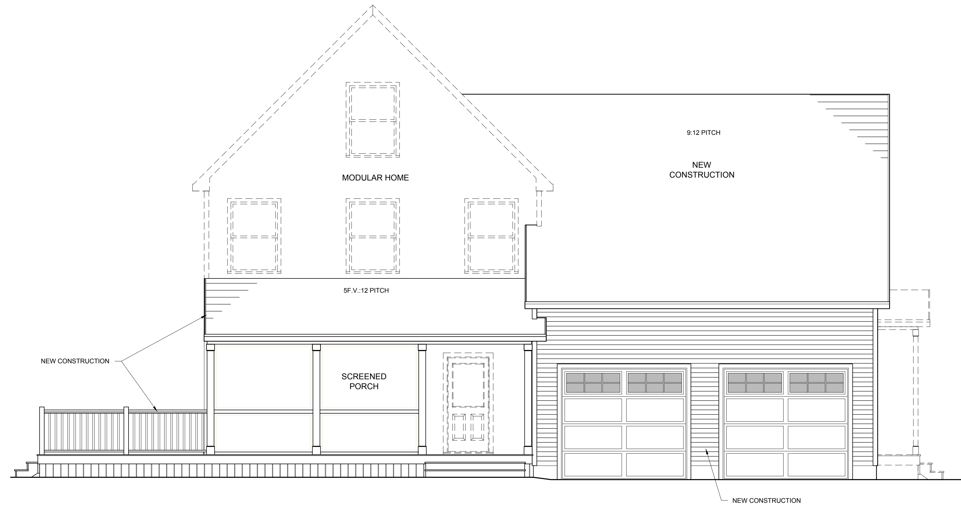
2 SOUTH ELEVATION 1/4" = 1'-0"