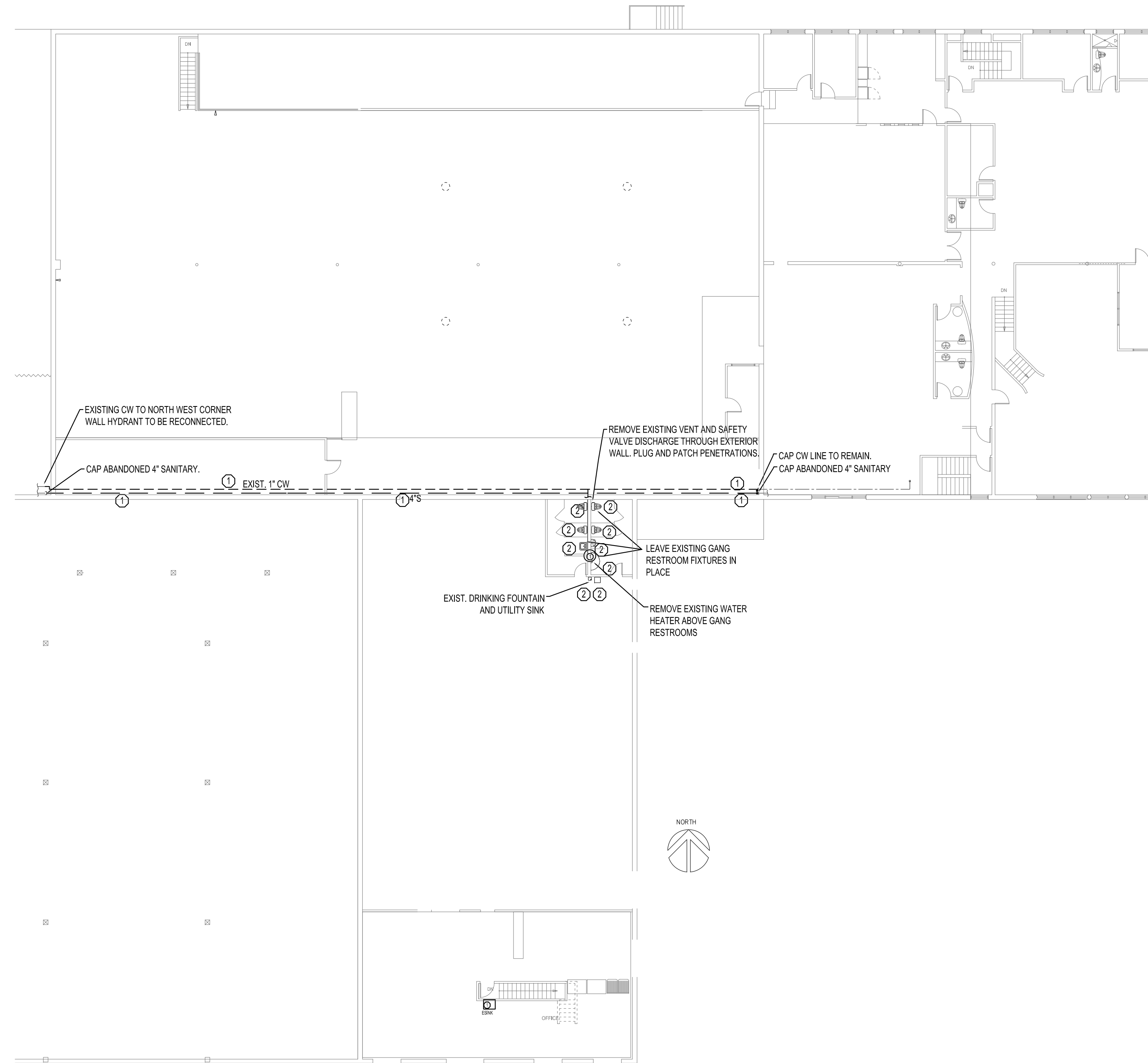
SECOND FLOOR - PLUMBING DEMOLITION PARTIAL PLAN SCALE: 1/16"=1'-0"