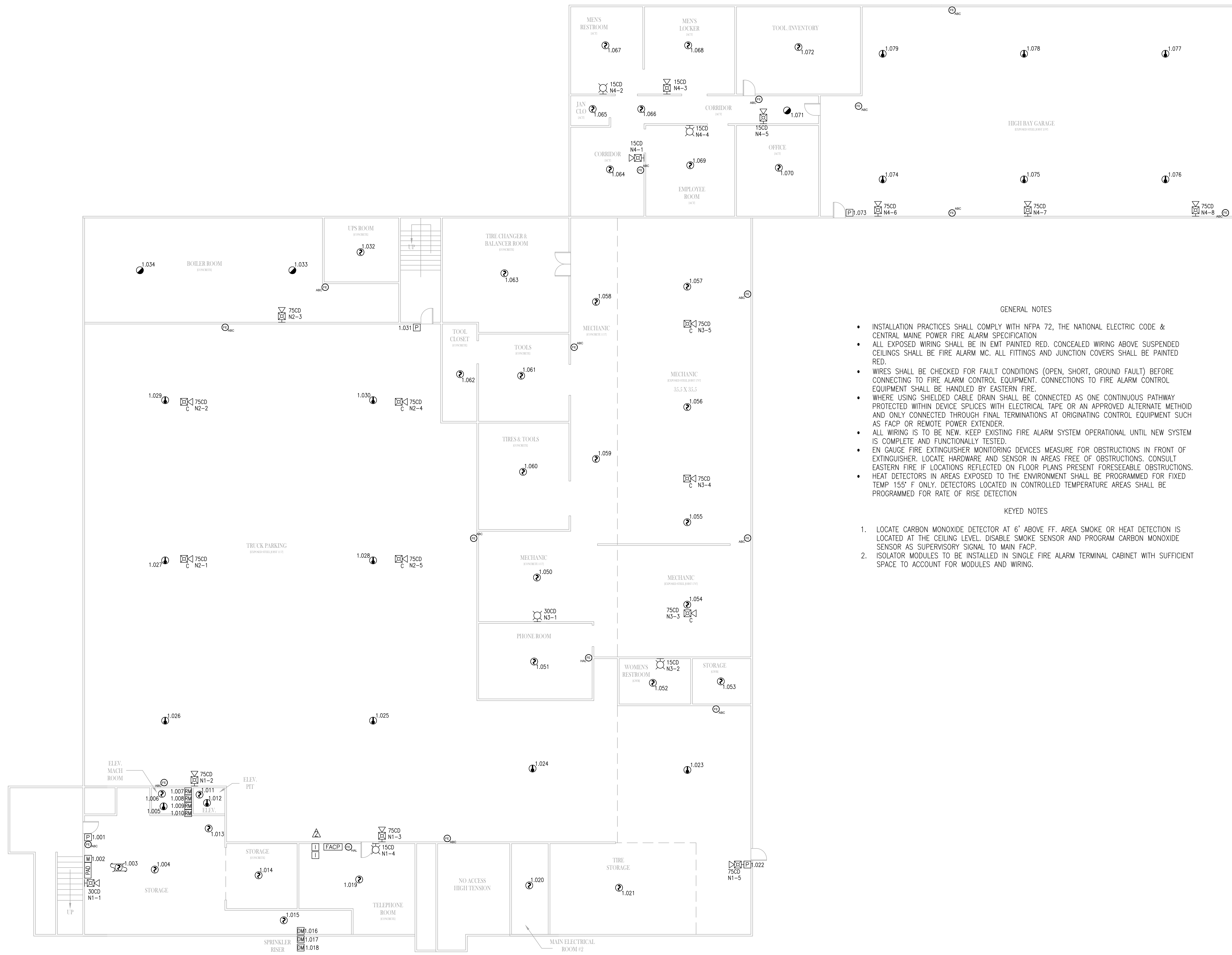
FIRE ALARM SYSTEM LAYOUT - GROUND FLOOR SCALE: 1/8" = 1'