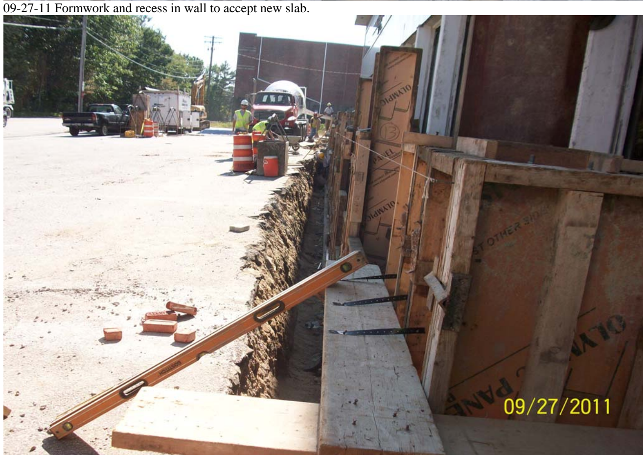
09-27-11 Placing concrete at new addition south wall.