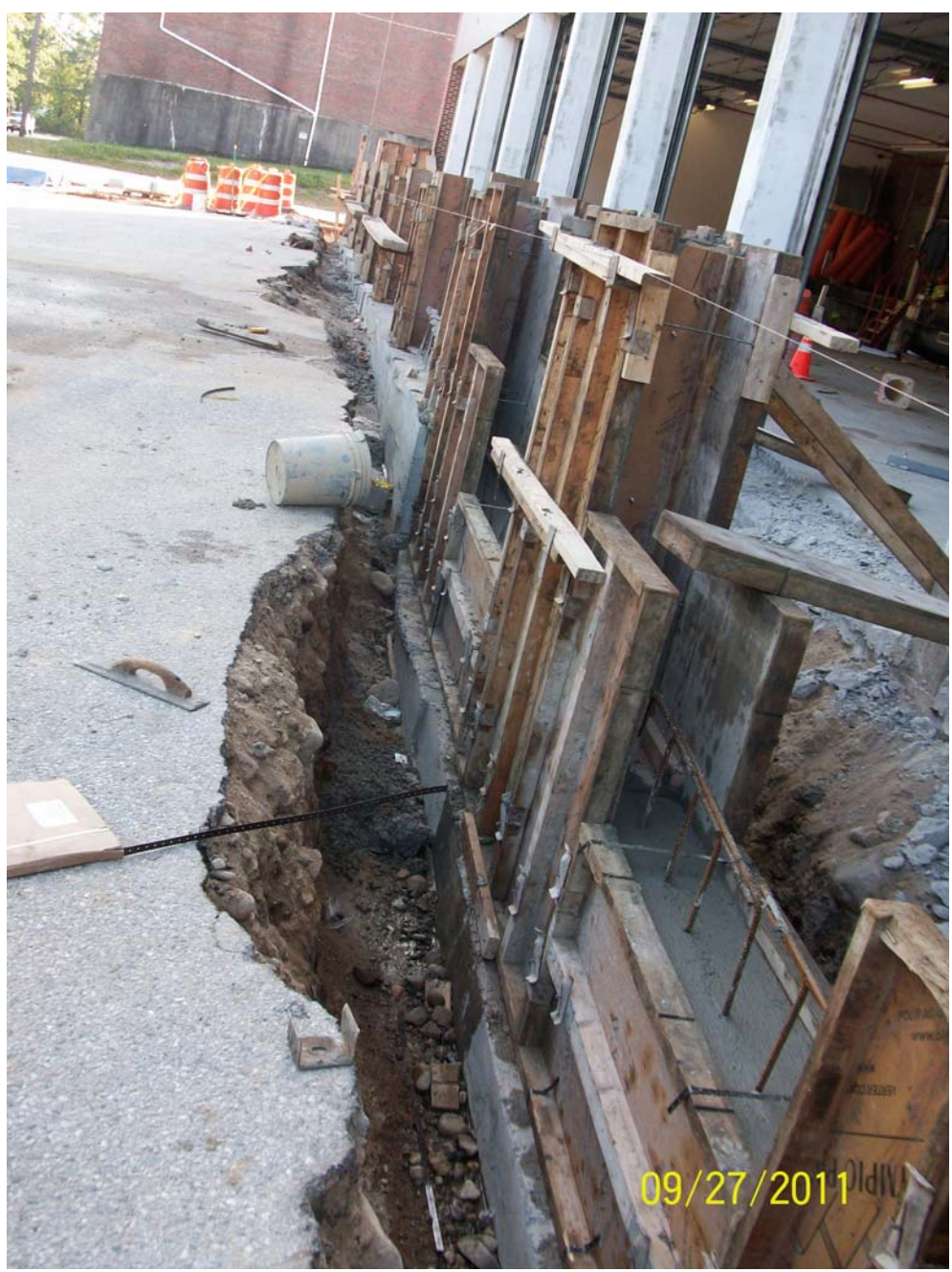
09-27-11 Concrete in place.