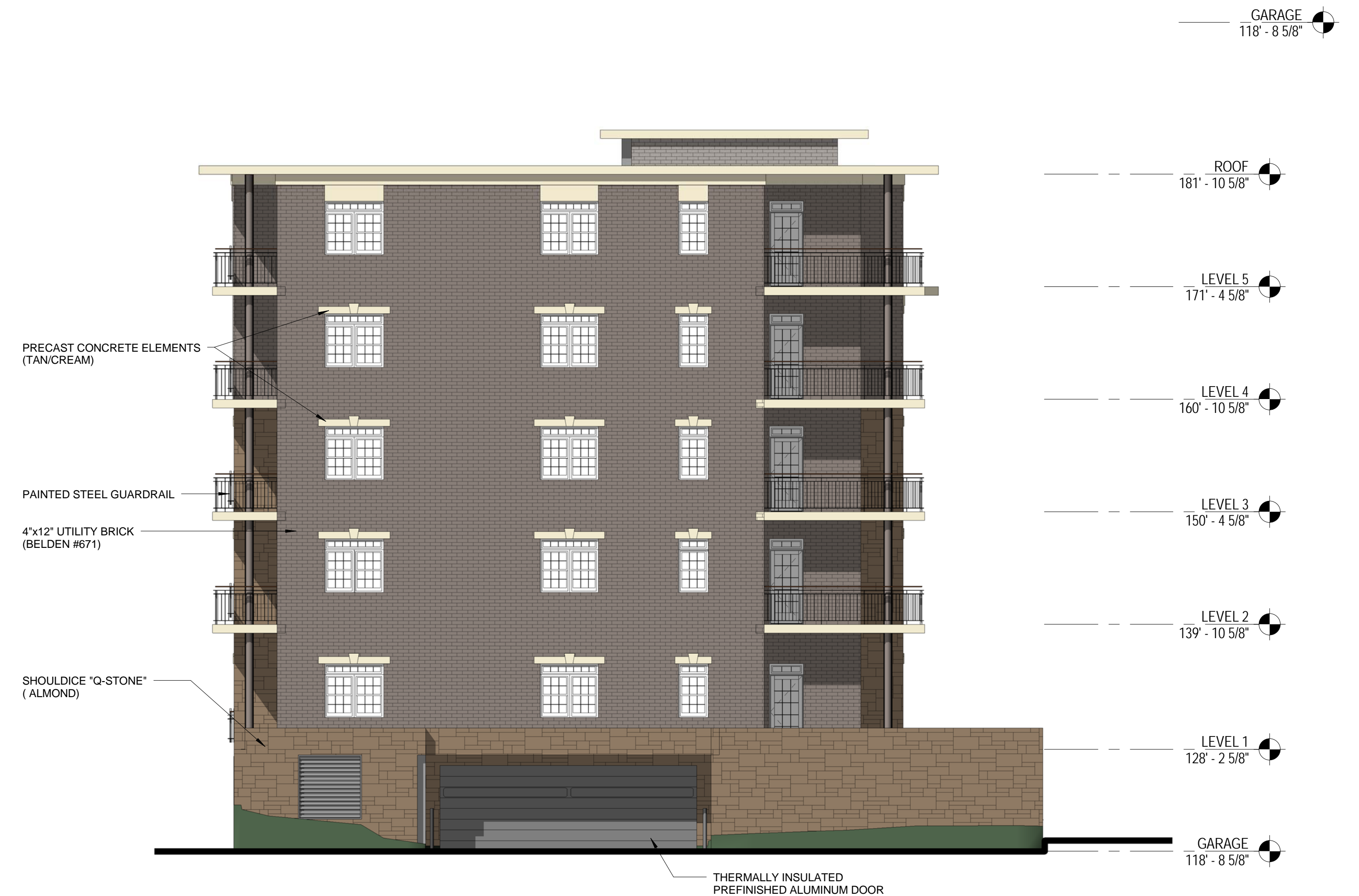
D NEW BUILDING - SOUTHEAST ELEVATION 008 1/8" = 1'-0"