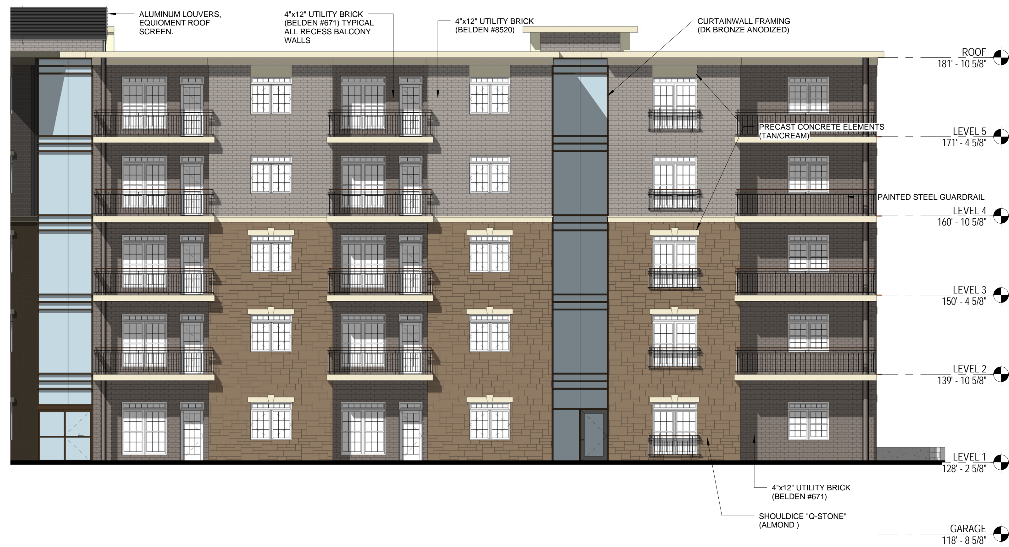
C NEW BUILDING - SOUTHWEST ELEVATION 008 1/8" = 1'-0"