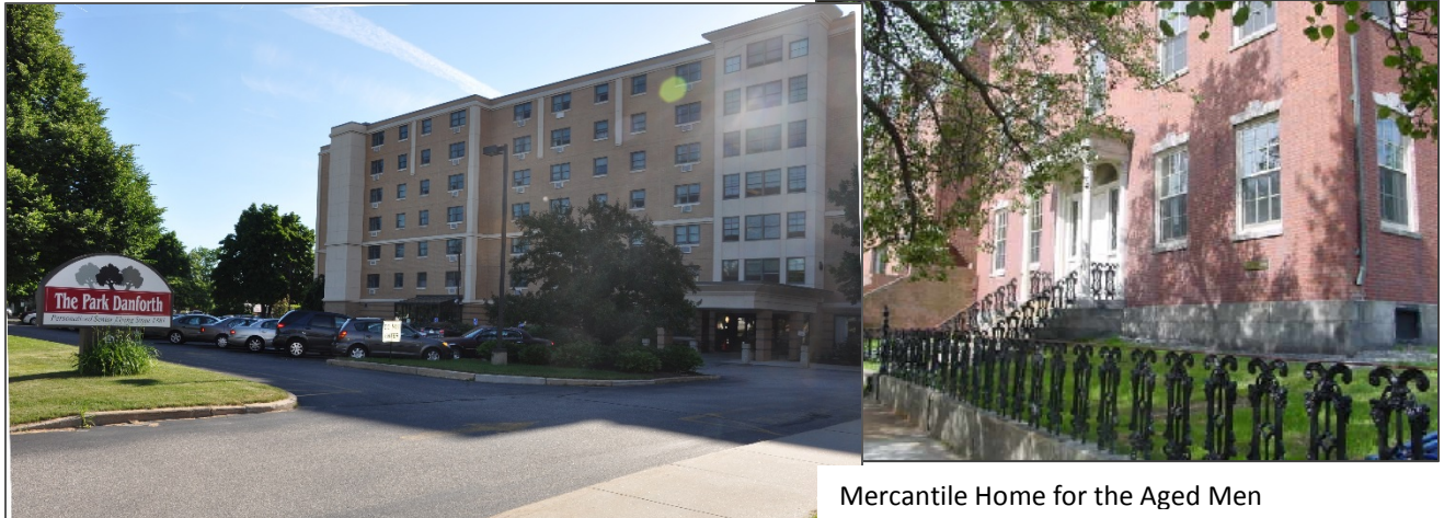
Current location at 777 Stevens Avenue