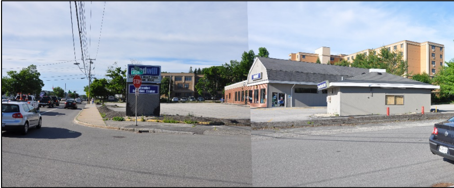
Goodwill Property, Forest Ave. & Arbor St.

The Park Danforth properties consist of 8 parcels identified on the Assessors maps as Map 146, Chart C, Lot's 5-12 & 14. Over the past 5 years, The Park Danforth has negotiated the purchase of the adjacent parcels that include the Goodwill properties along Forest Avenue extending to Stevens Avenue and two existing residential properties along Arbor Street and presently own an entire city block with the exception