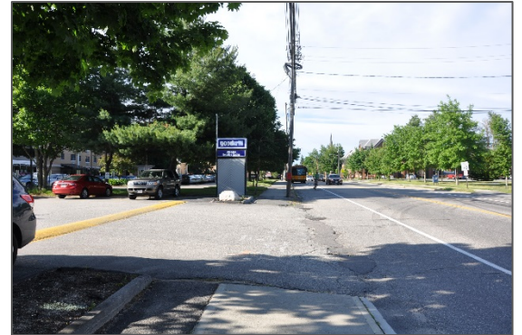
Goodwill entrance: view Stevens Ave south

of one residential property, 24 Arbor Street, identified as lot 13. They have been in discussions with the property owner to purchase however due to health issues discussions are temporally on hold. Further discussions will continue when appropriate.