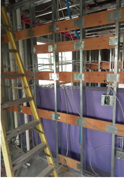
(Unit 1412 pictured)