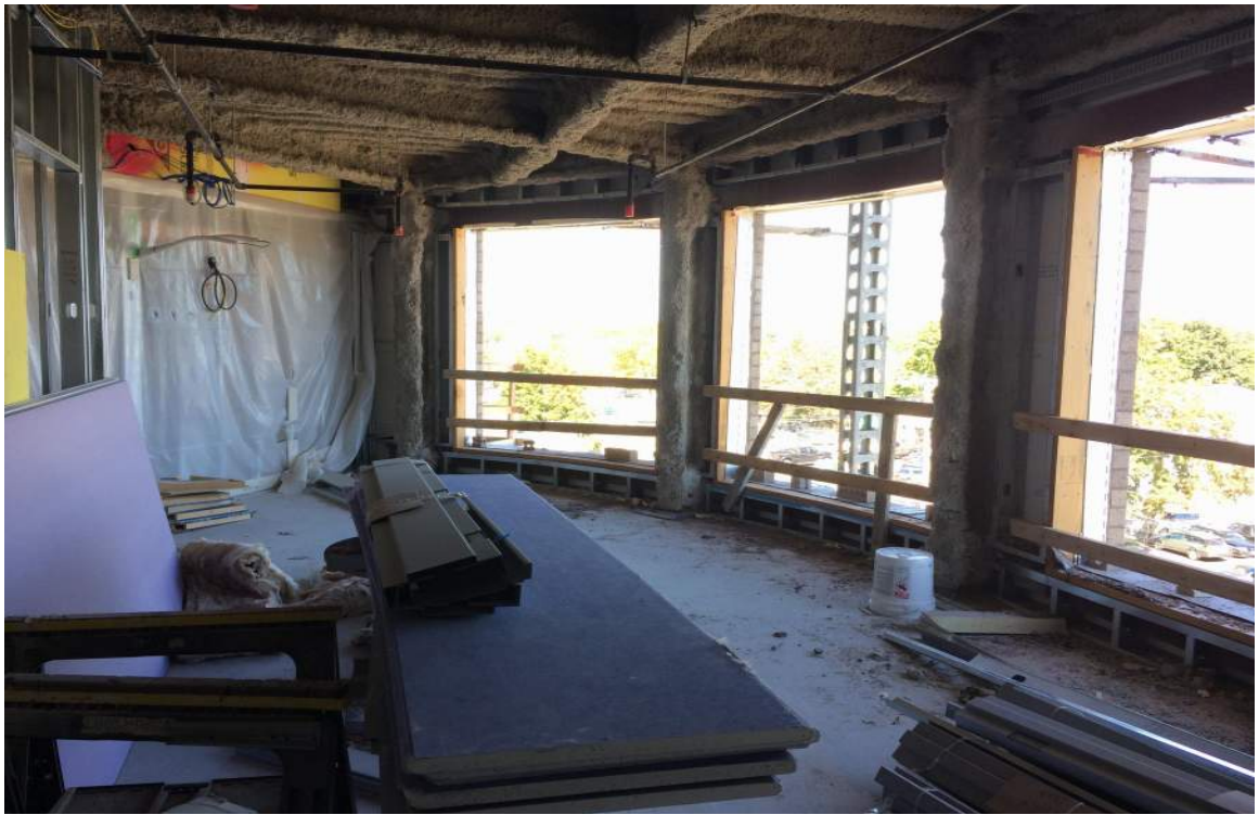
Level 4 Community Room