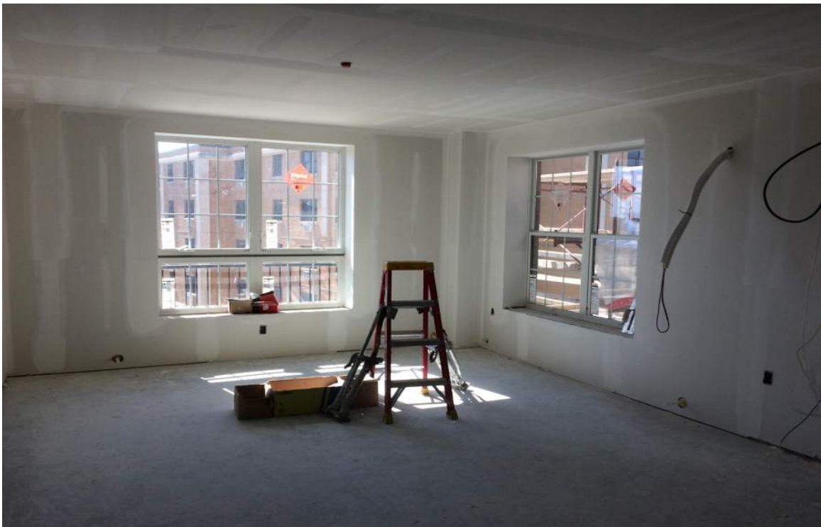
Typical resident apartment - Level 5