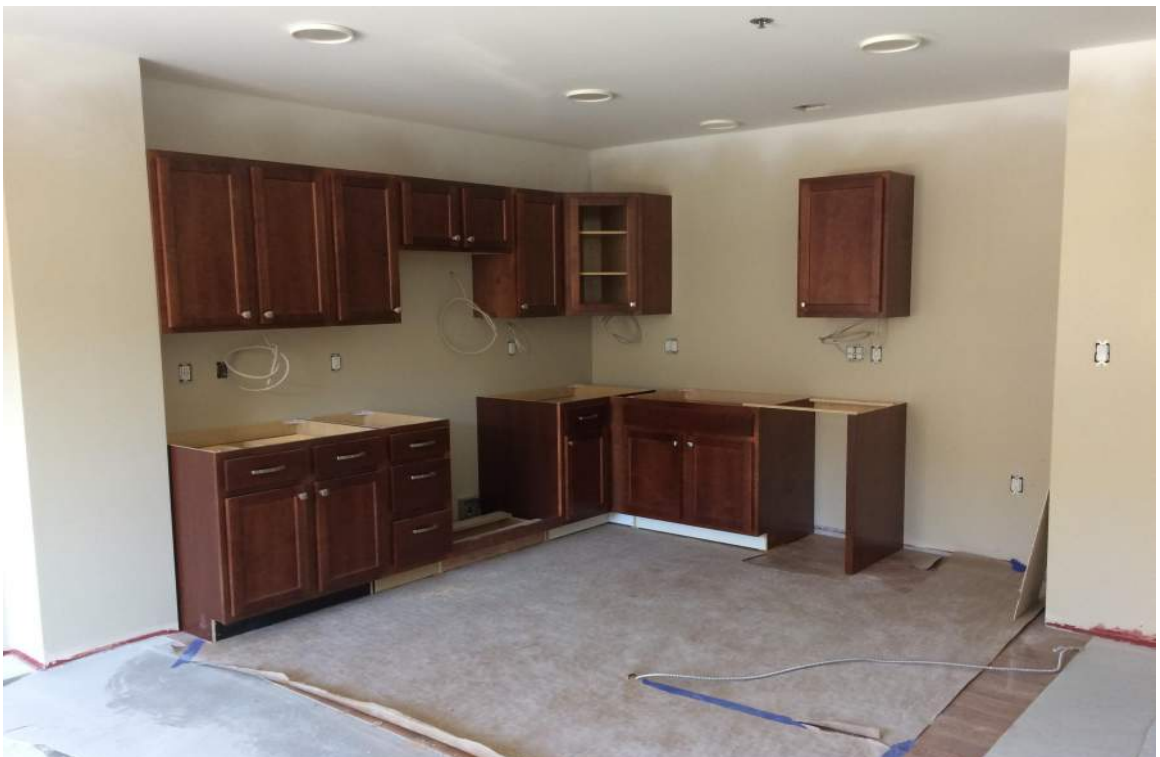
Typical resident apartment - Level 3