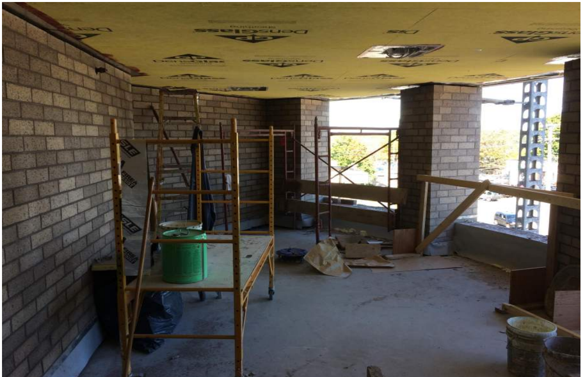
Level 3 Community Deck