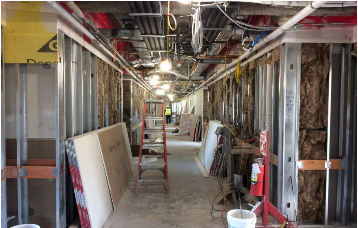
Level 5 corridor looking East