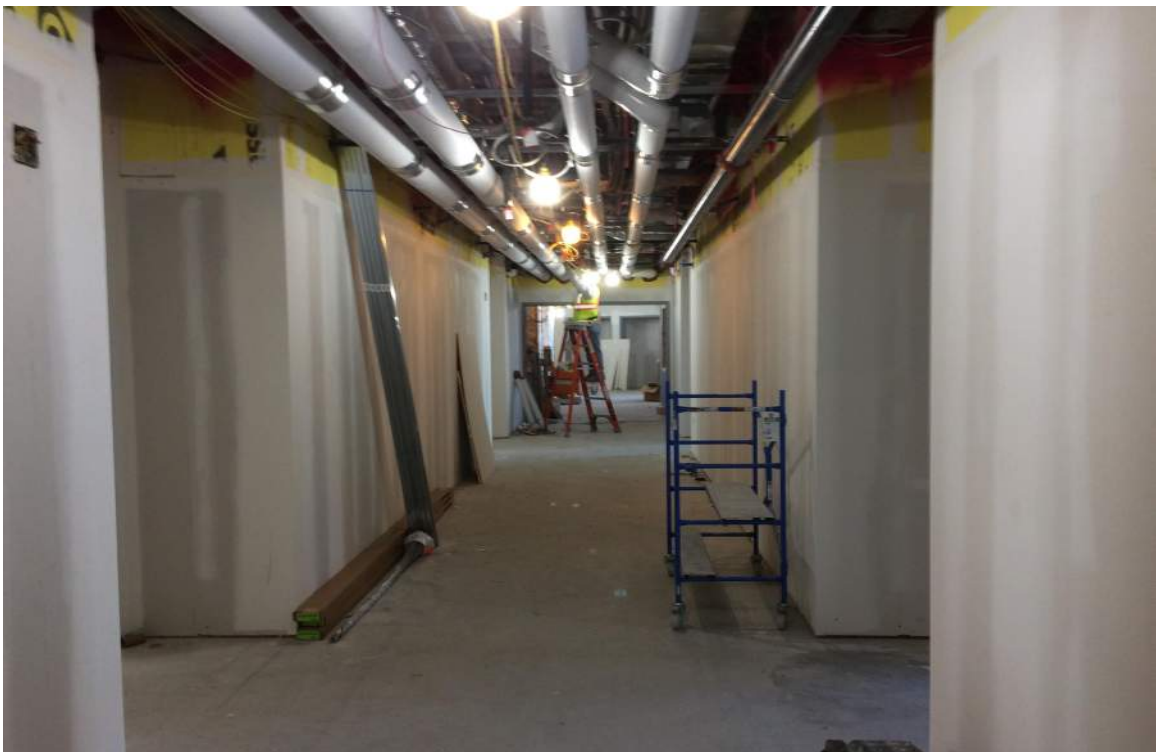
Level 1 corridor looking West