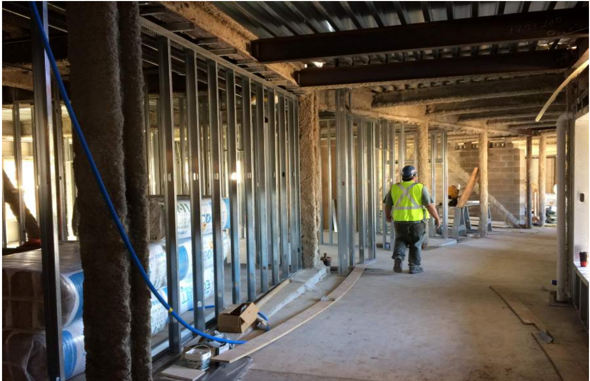
Connector corridor looking towards Main Street/Auditorium