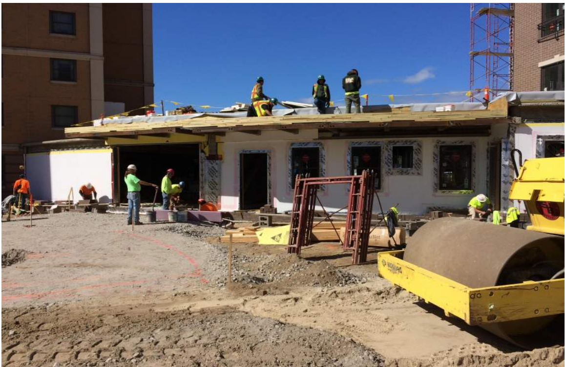
Connector from Courtyard