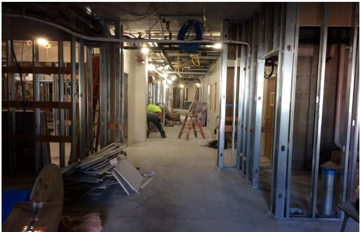
Main Street from outside the Auditorium looking towards existing reception/existing entrance