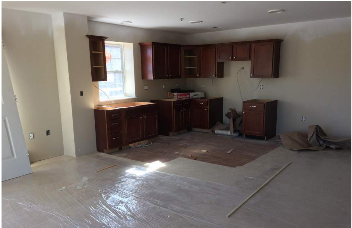
Typical resident apartment - Level 1