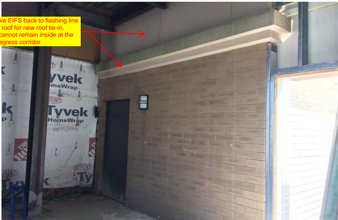
Existing egress stair wall at Auditorium