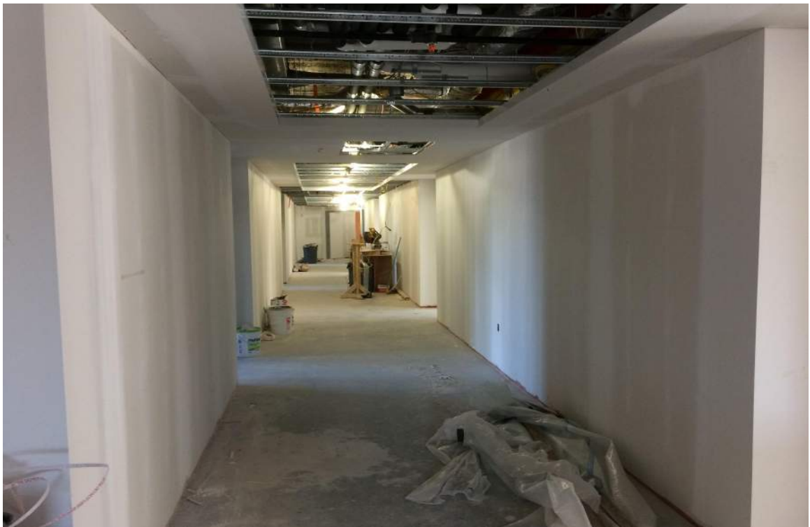
Level 3 corridor looking East