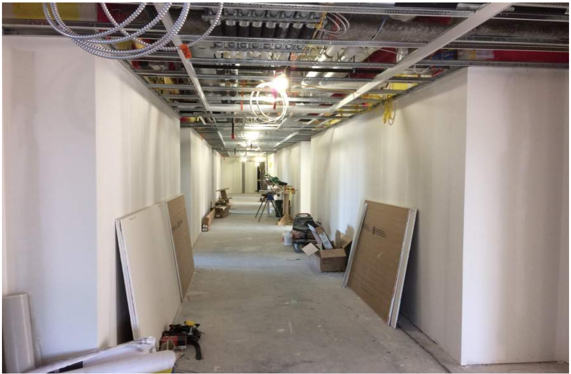
Level 4 corridor looking East