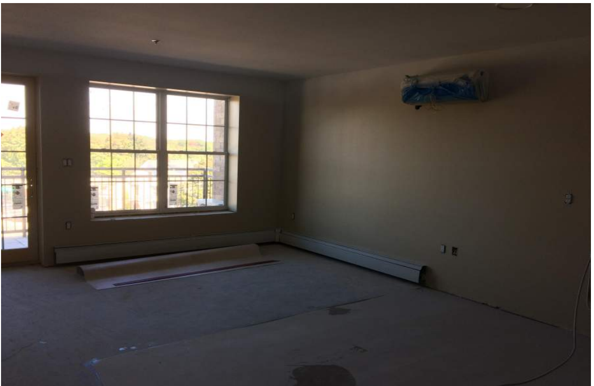
Typical resident apartment - Level 4