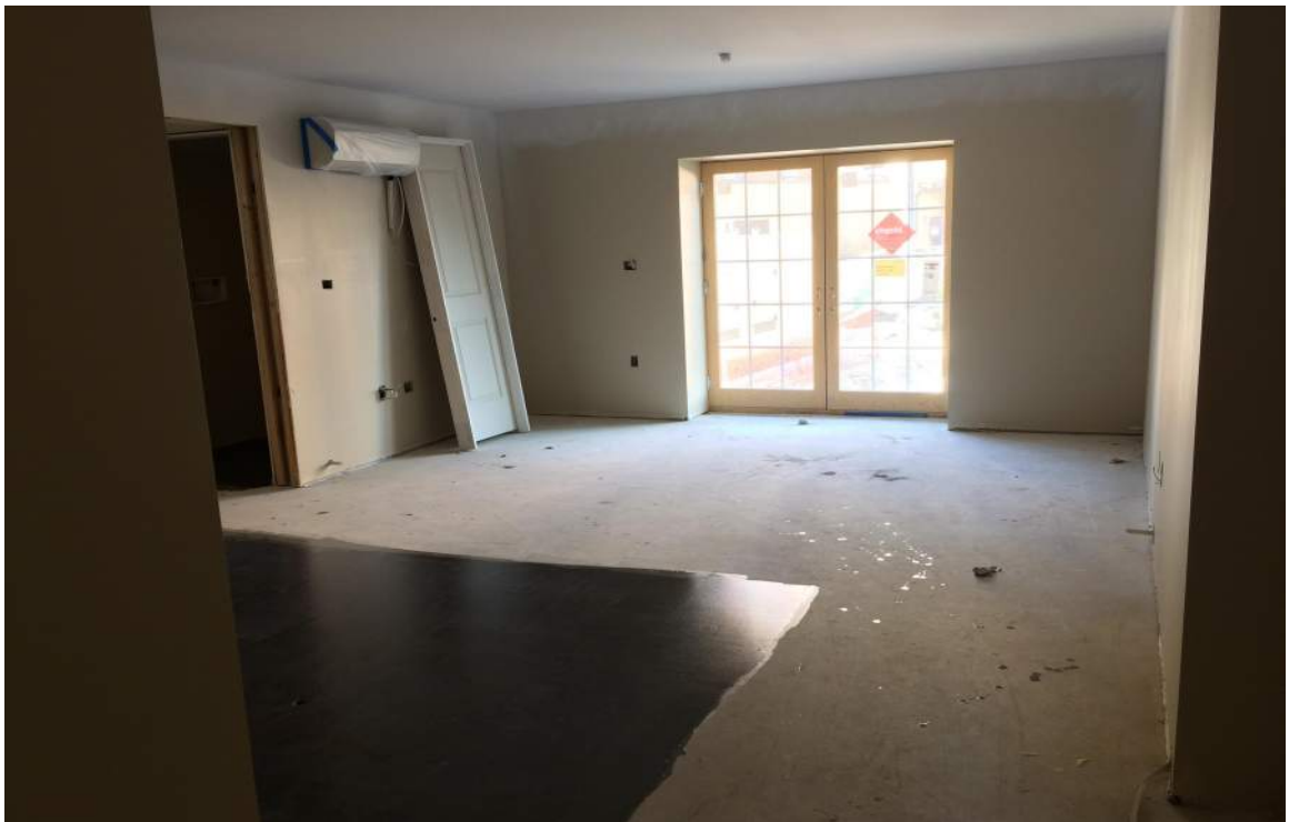
Typical progress in Level 1 Apartment