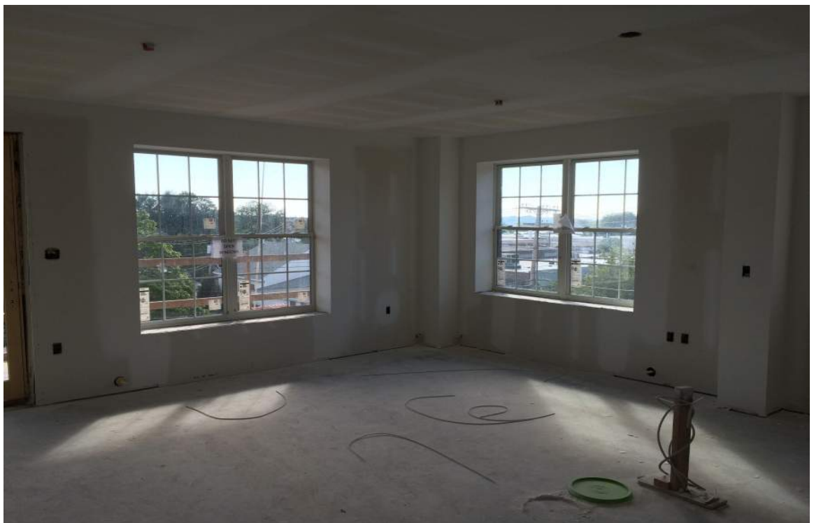
Level 3 Apartment