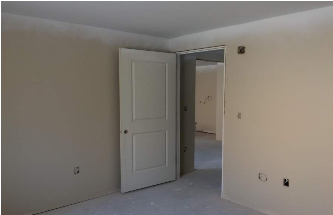
Typical progress in Level 2 Apartment