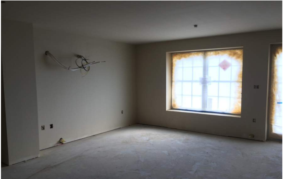
Level 3 Apartment