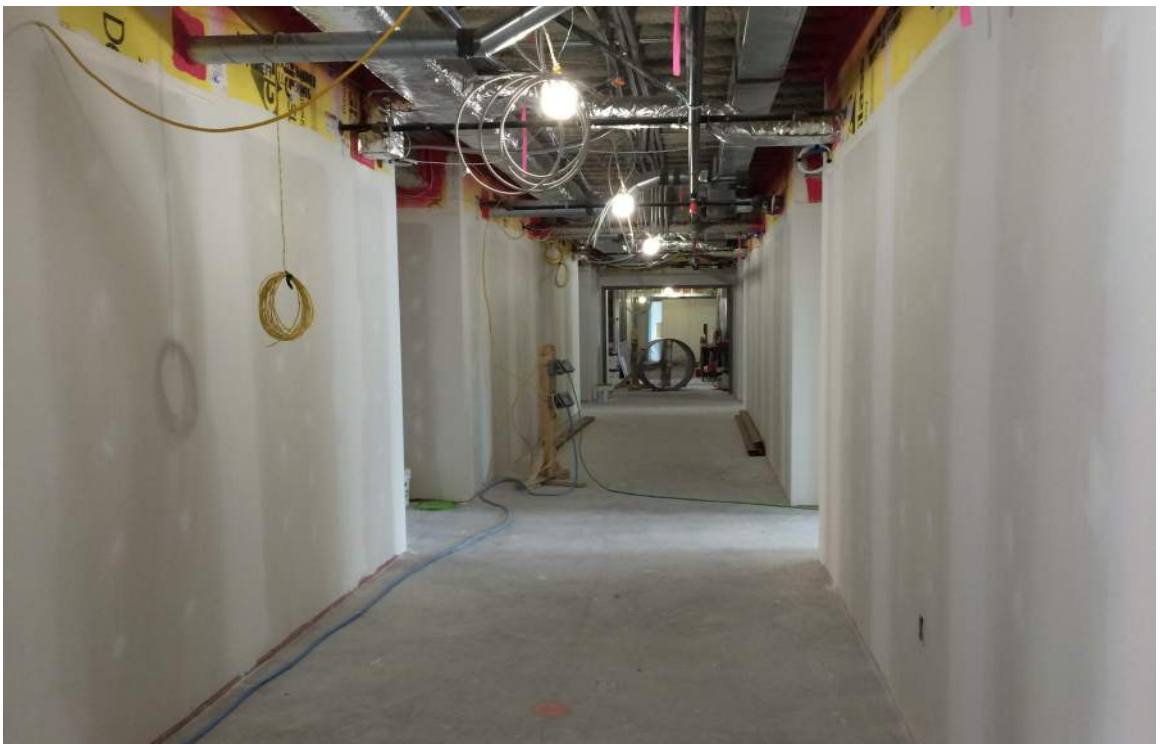
Level 3 Corridor