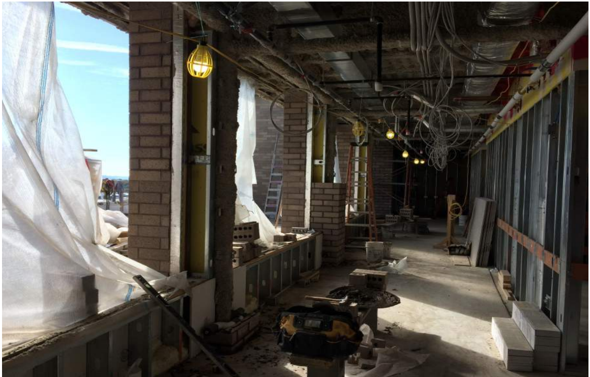
Level 5 Corridor looking toward roof deck