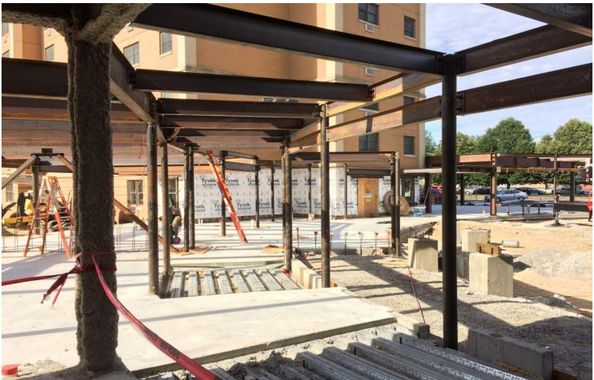
Connector framing from Board Room