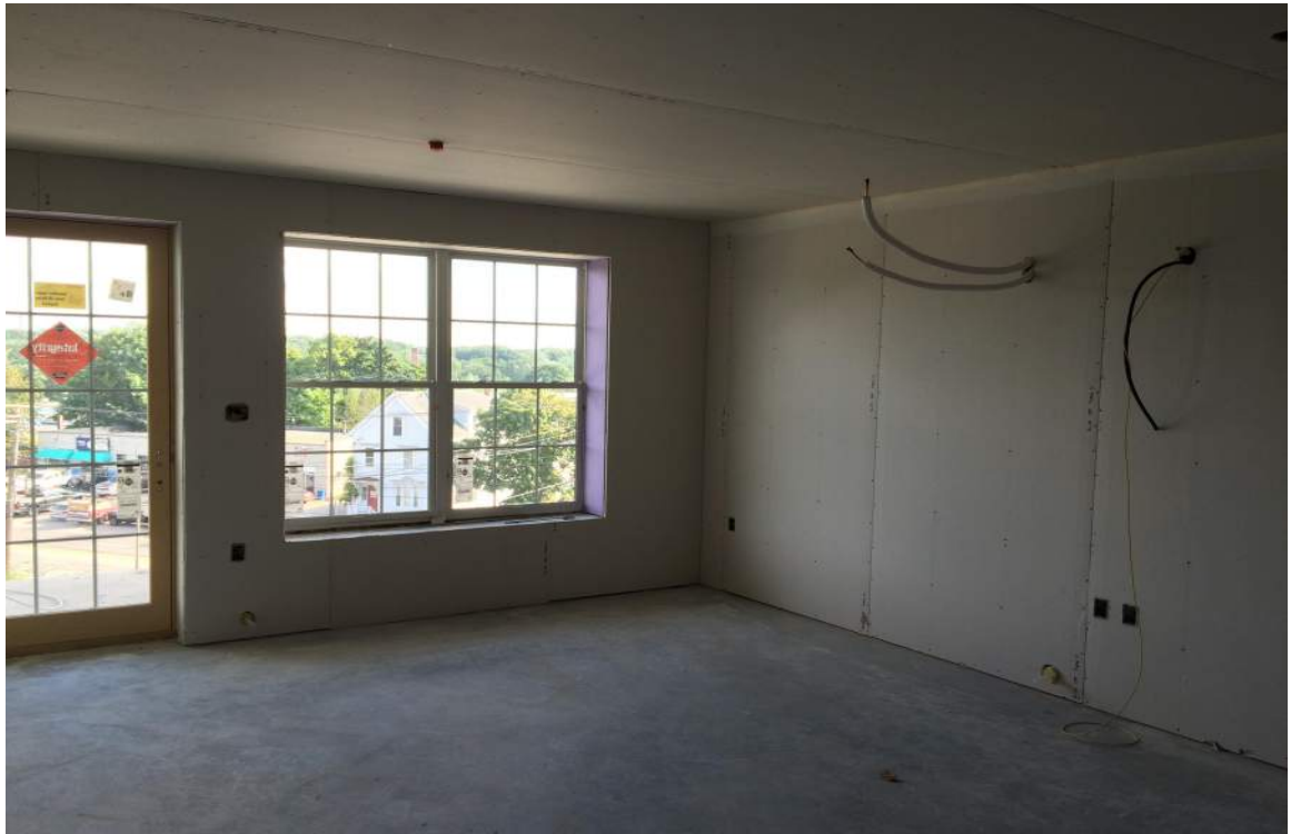
Typical progress in Level 4 Apartment