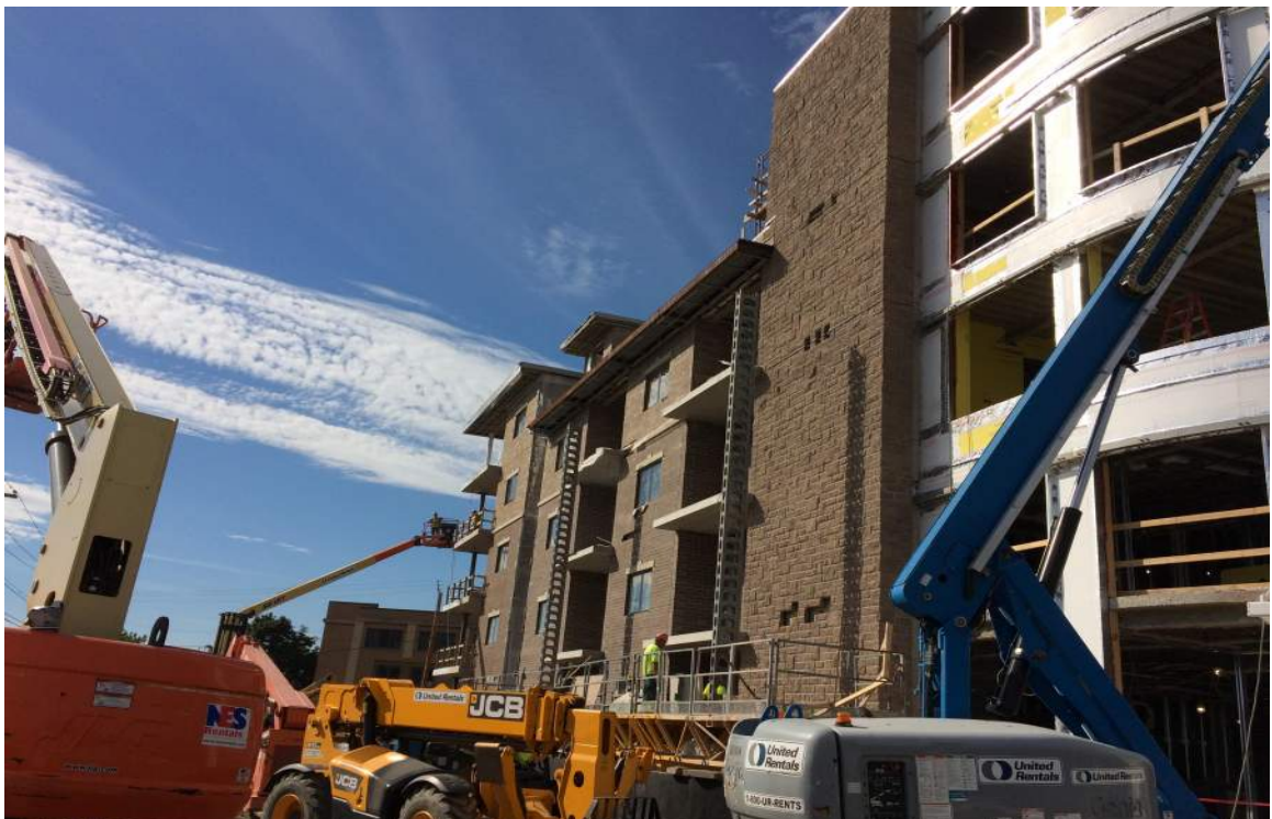
Forest Ave elevation