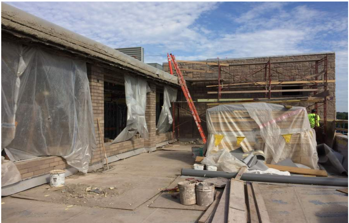
Level 5 Roof Deck