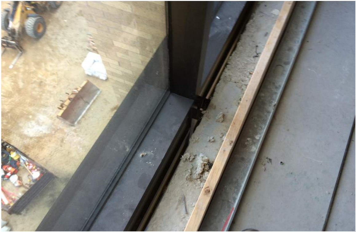
Typical Joint between curtainwall and floor; See Item #17.3