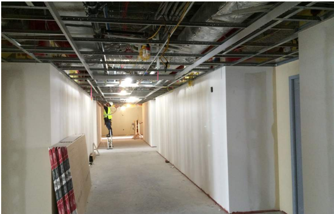
Corridor - Level 2: East