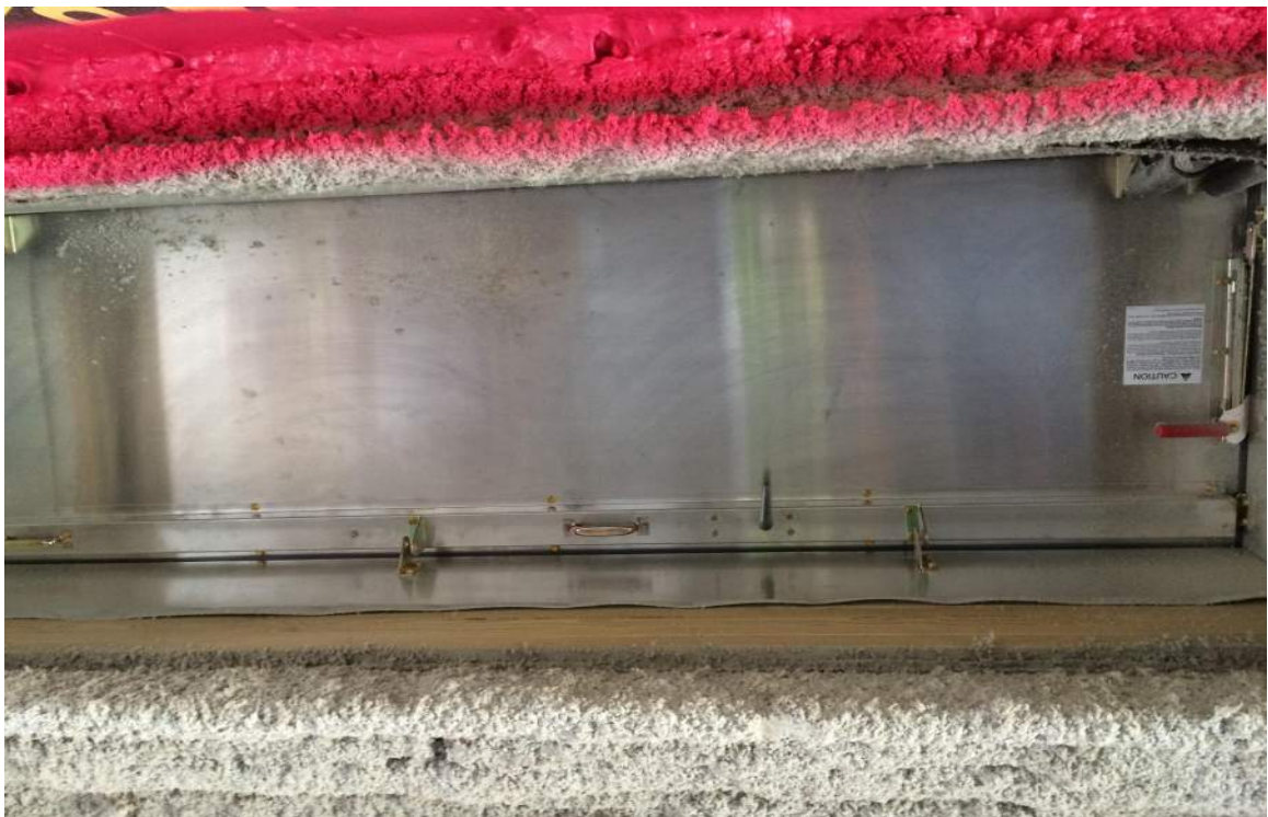
Roof Hatch - East wing - See Item #17.2