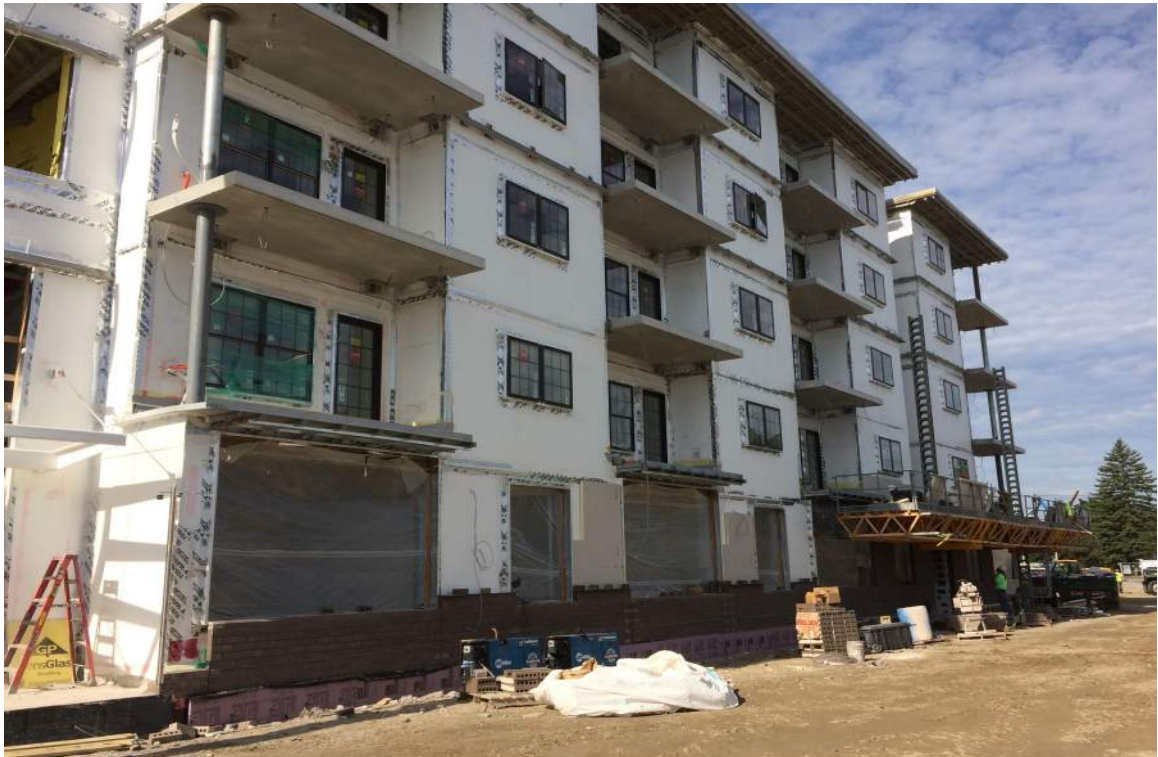
Arbor Street Elevation