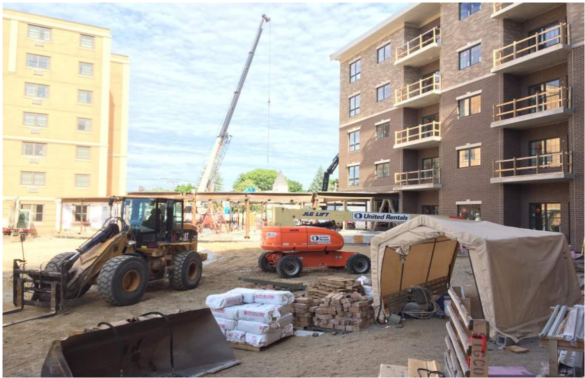
Courtyard looking toward connector