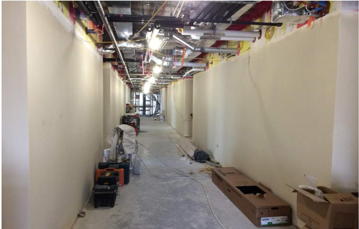
Corridor - Level 2: West