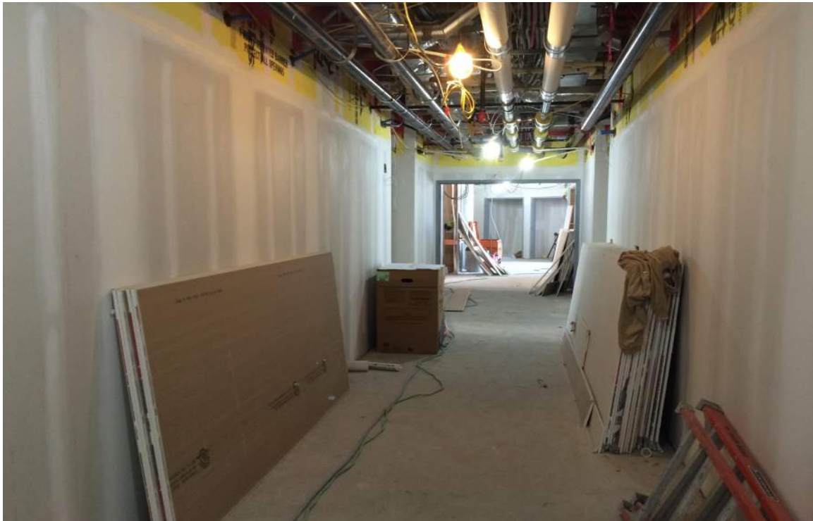
Level 1 Corridor