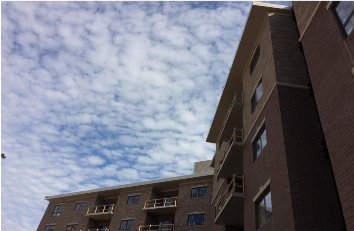
Aluminum roof soffit panels