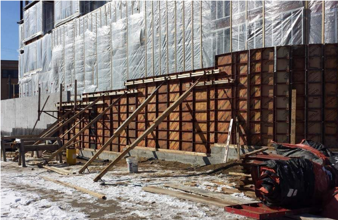
Exterior Forest Ave terrace formwork