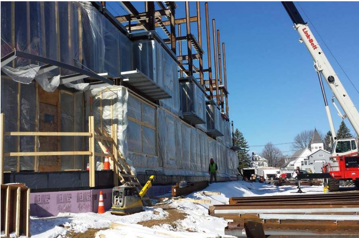
West wing tower north side