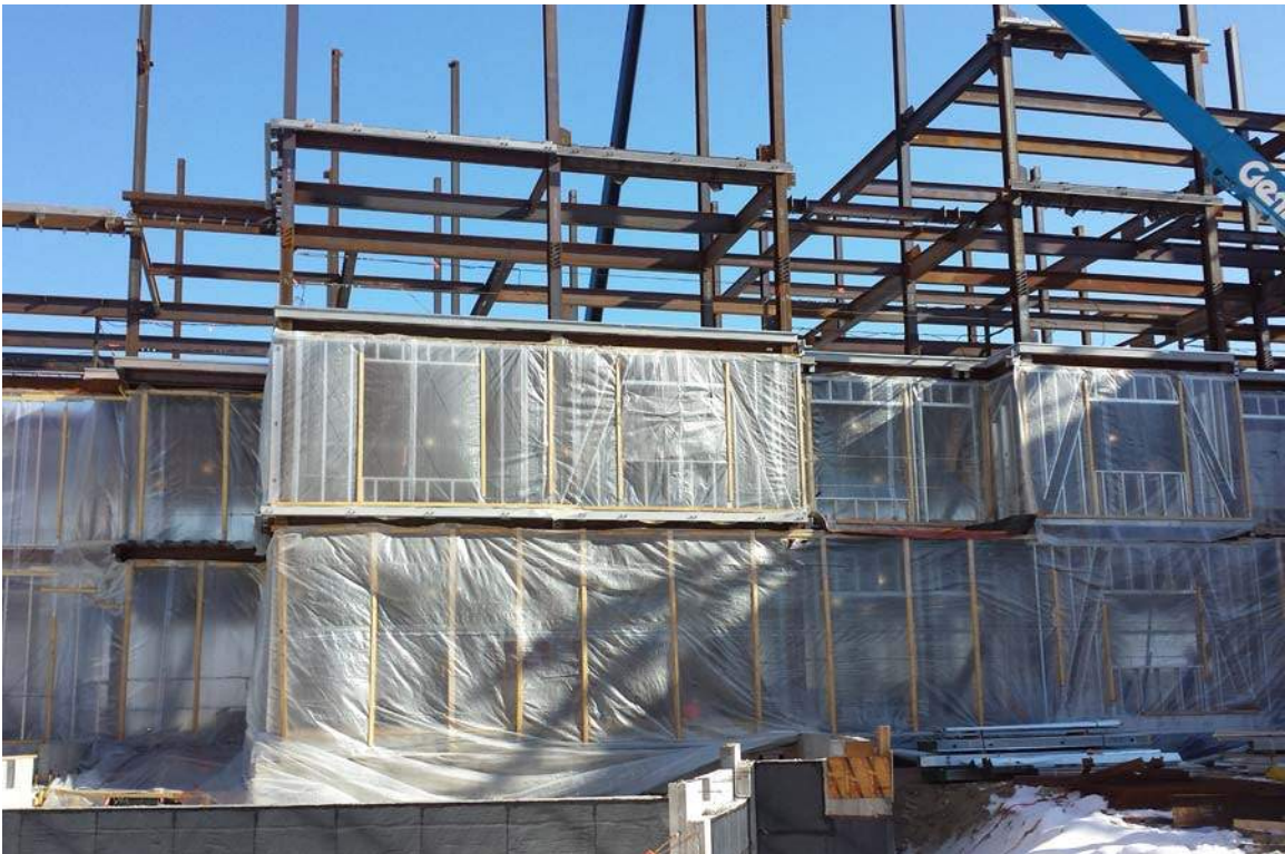
West wing of Tower from courtyard looking North