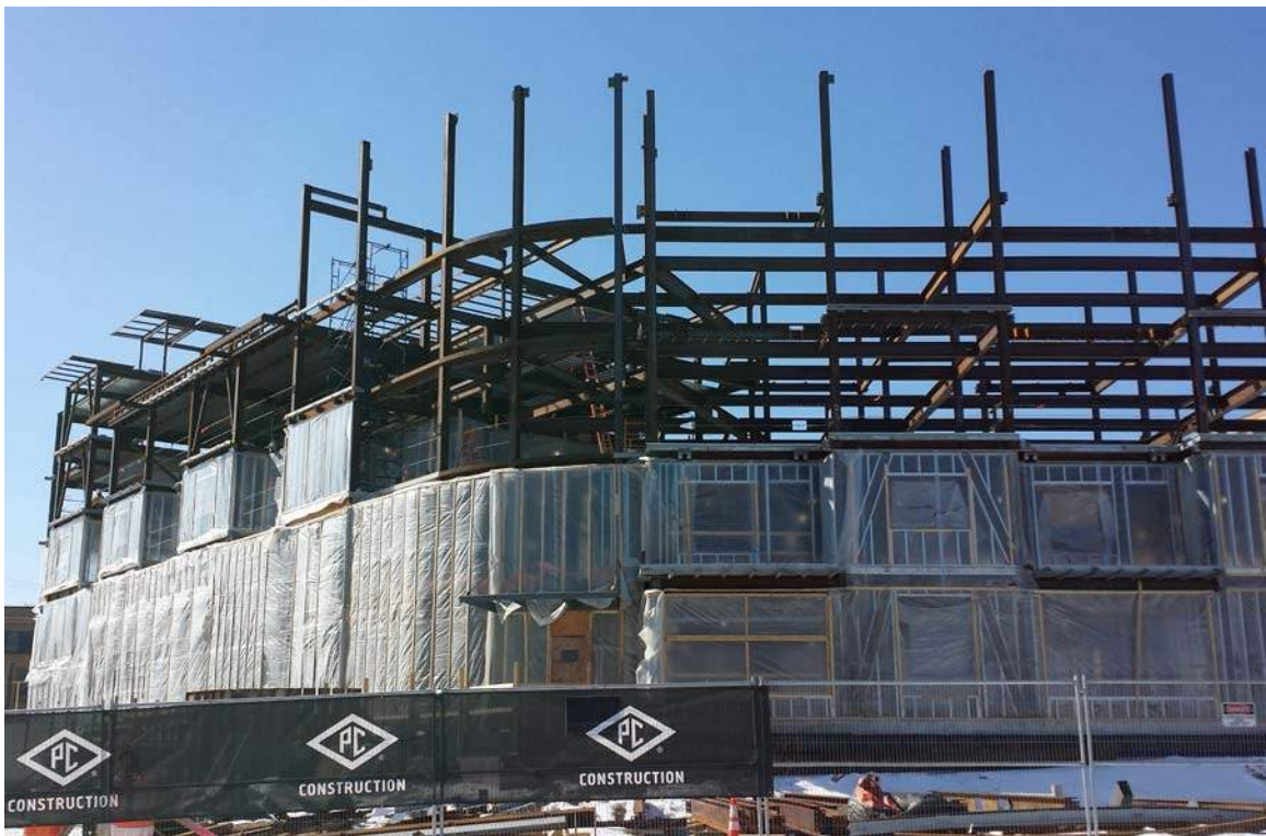
Tower from Arbor Street at Forest Ave.