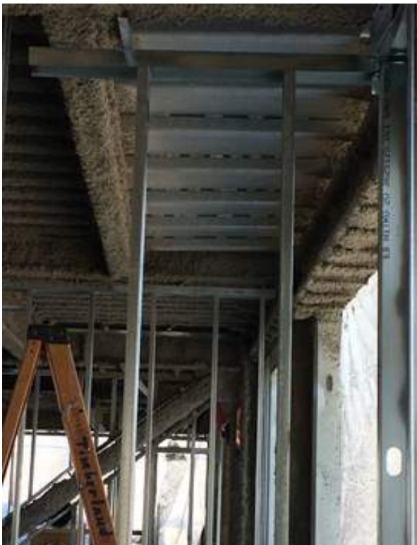
Balcony steel underside from administrative offices (between grid lines 2.5 and 3)