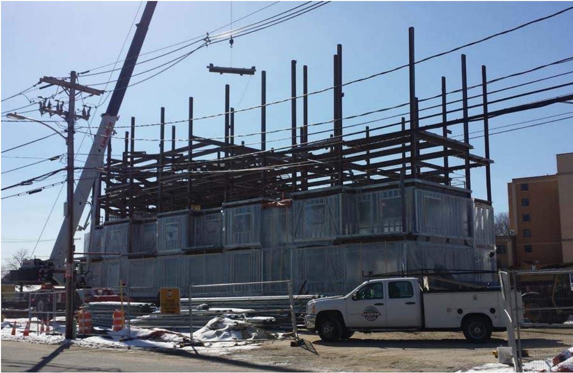
West wing from Arbor street looking south east