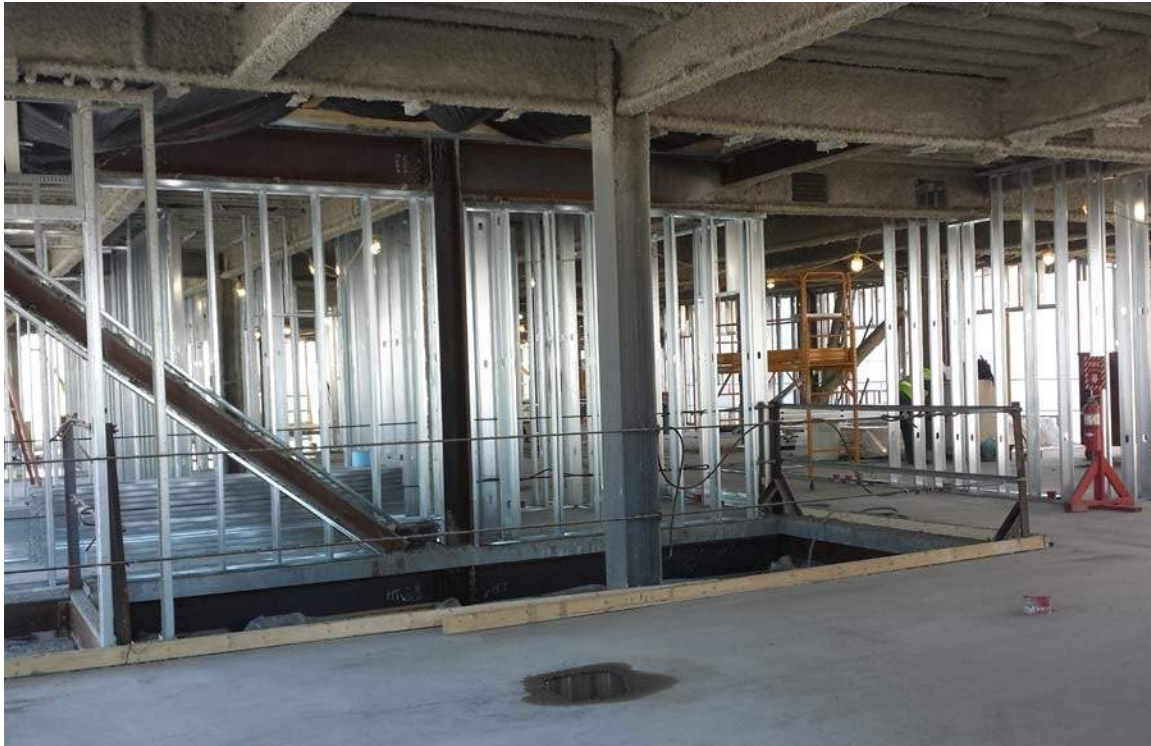
Level 1 administrative area interior partition