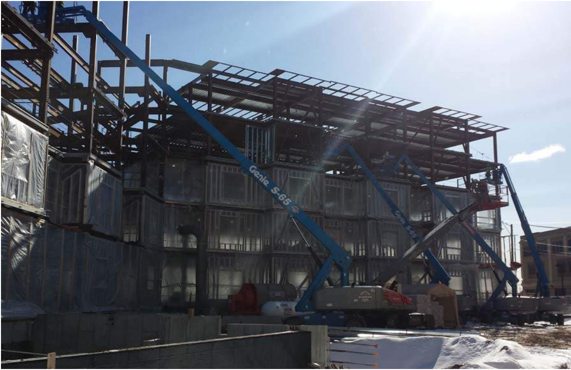
East wing of tower from courtyard looking south east