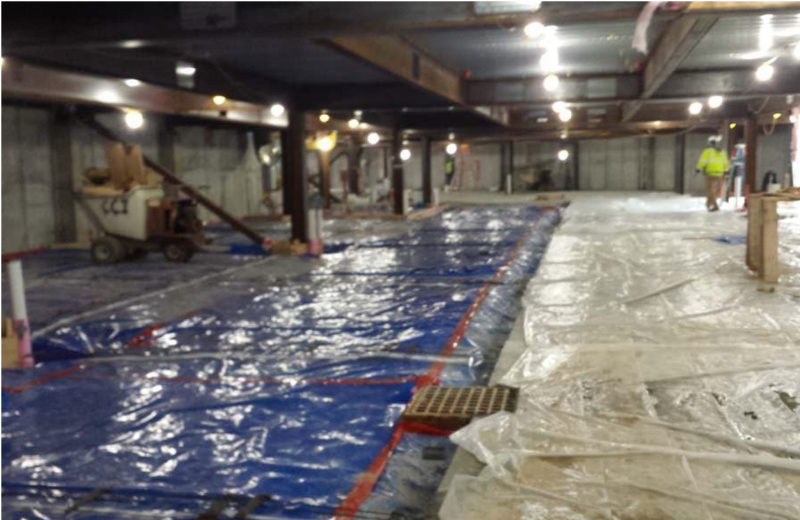
East wing parking garage