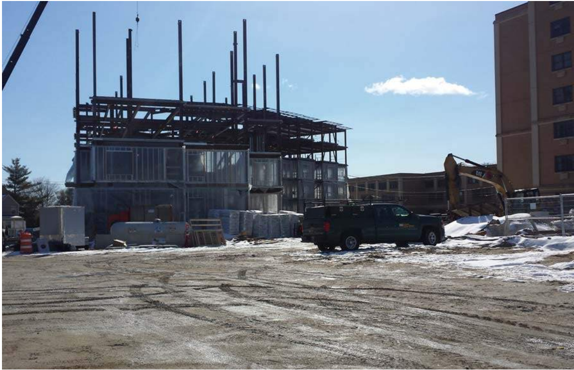
Tower looking south east