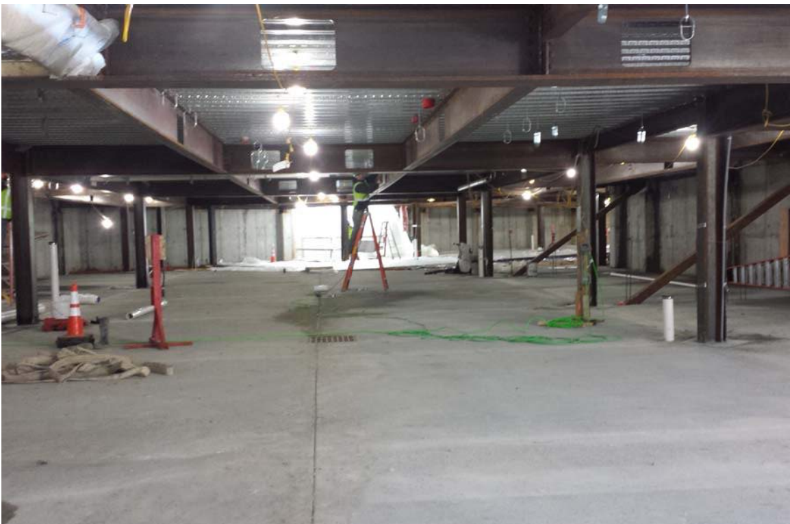
West wing parking garage