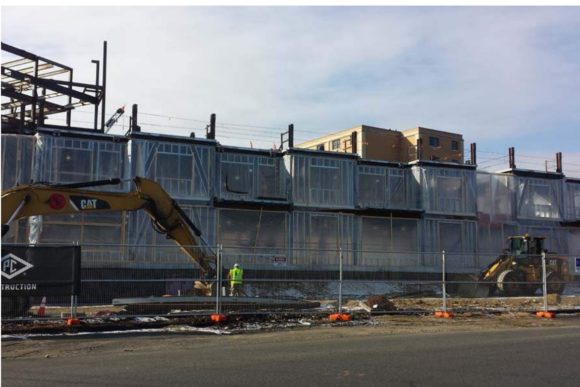
Tower west wing from Arbor St. and Forest Ave.