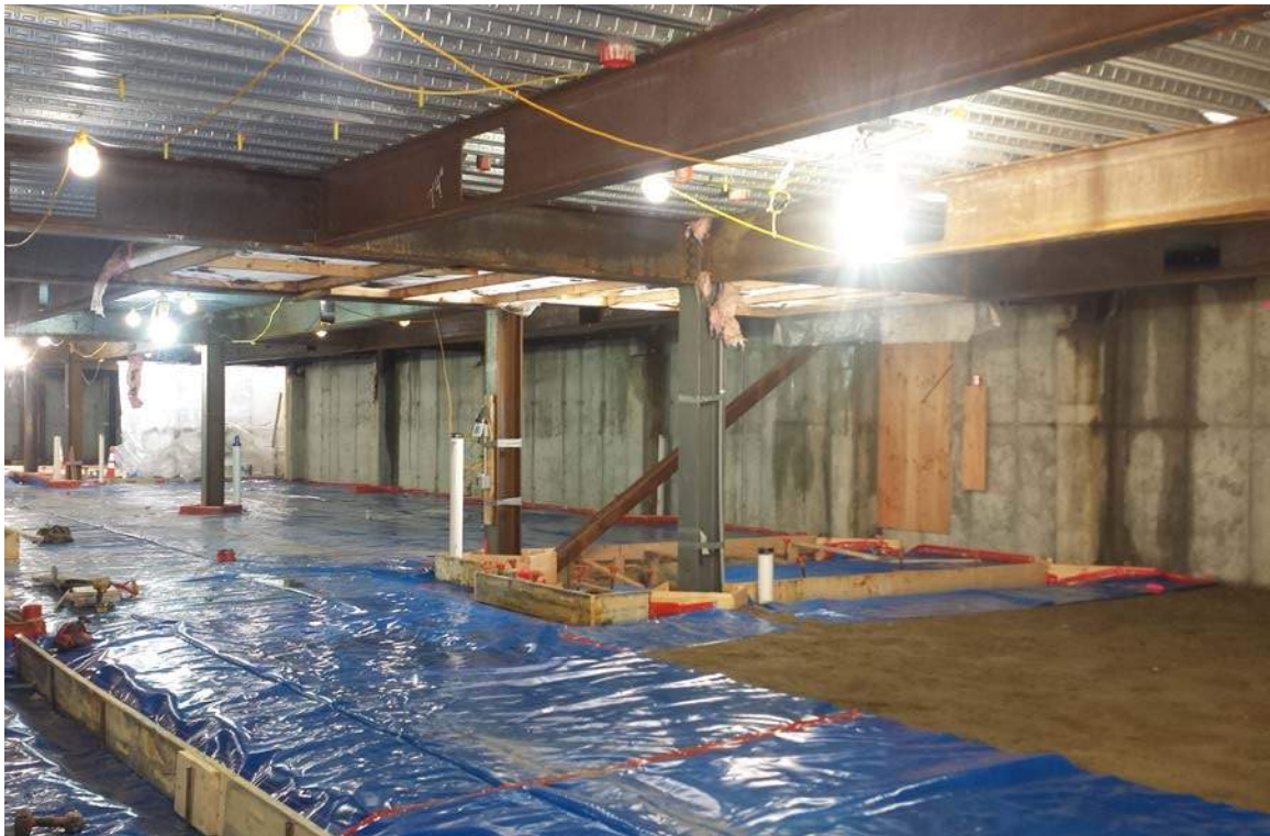
Tower east wing garage level