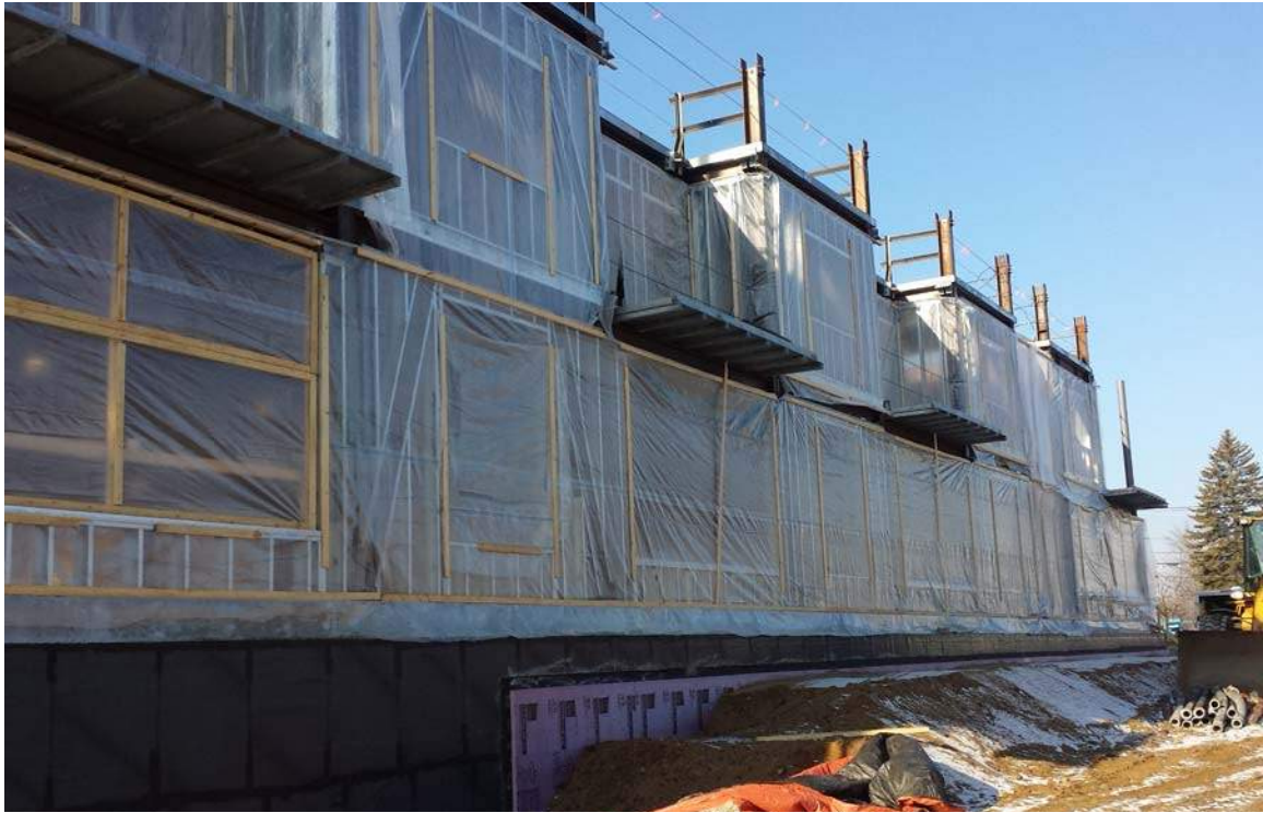
West Wing balconies over Admin Suite.