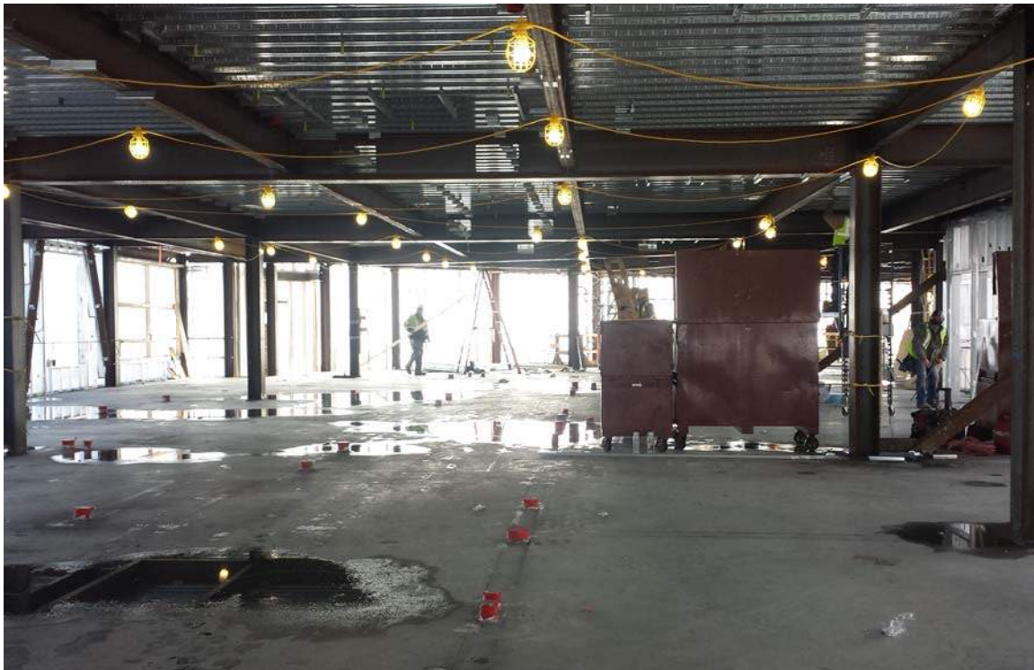
Level 1 interior