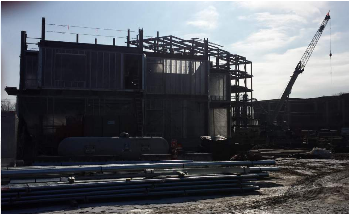
New tower from Arbor Street looking south east