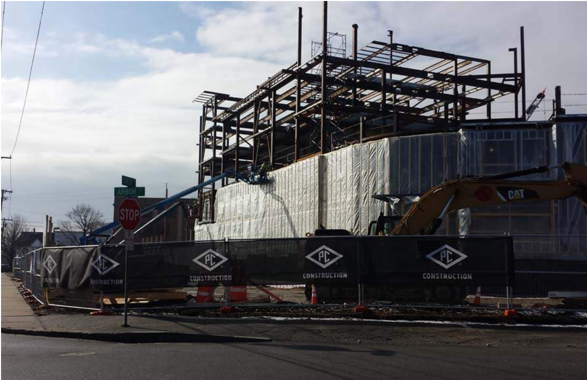
Tower east wing from Arbor St. and Forest Ave.