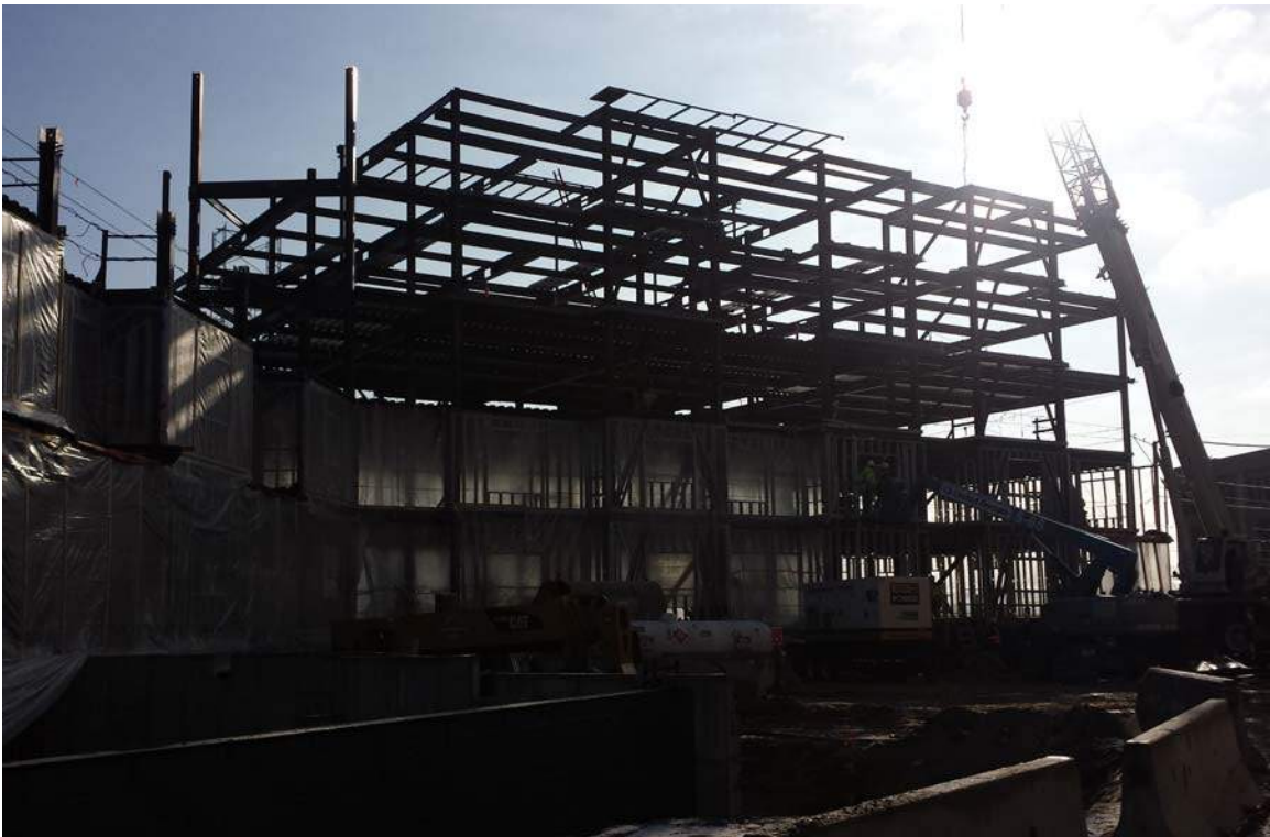
Tower east wing from courtyard side