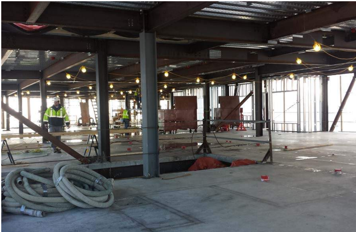
Level 1 interior from end of West Wing