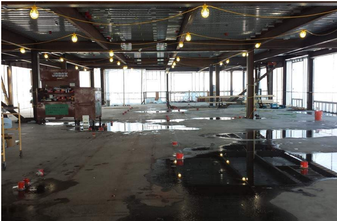
Level 1 interior