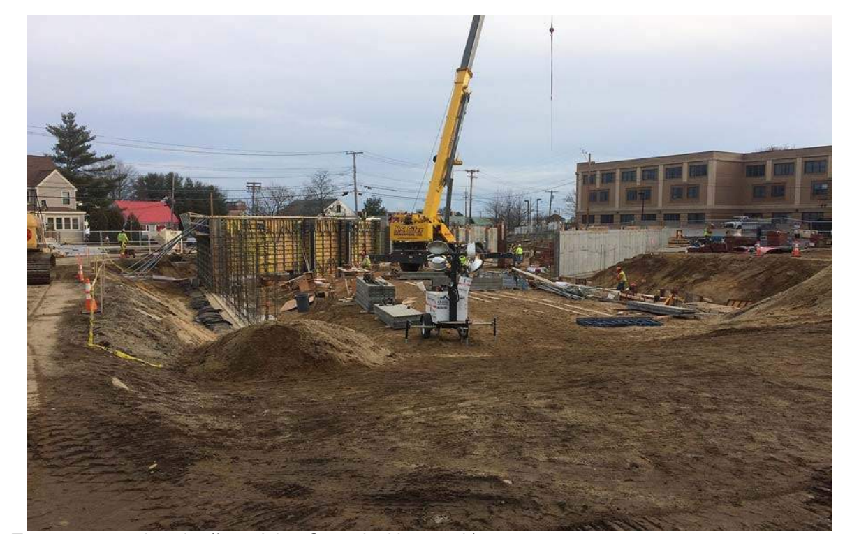
Tower construction site (from Arbor Street looking south)