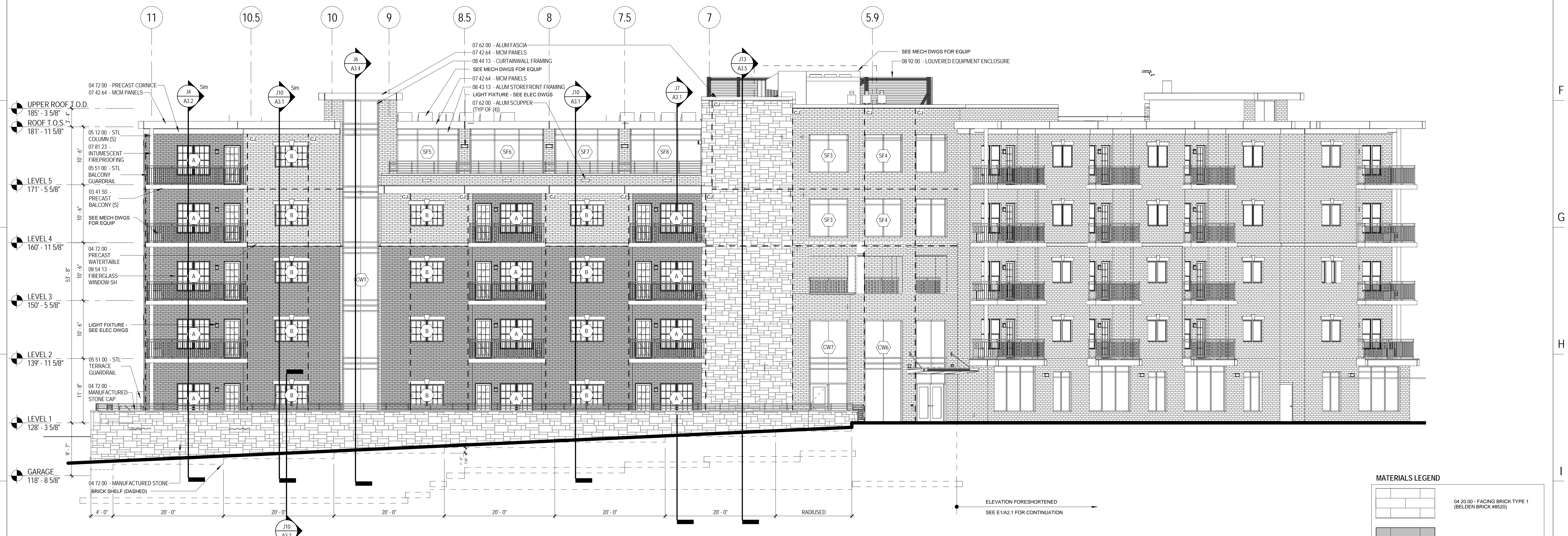
J1 NEW BUILDING - NORTHEAST ELEVATION A2.1 1/8" = 1'-0"