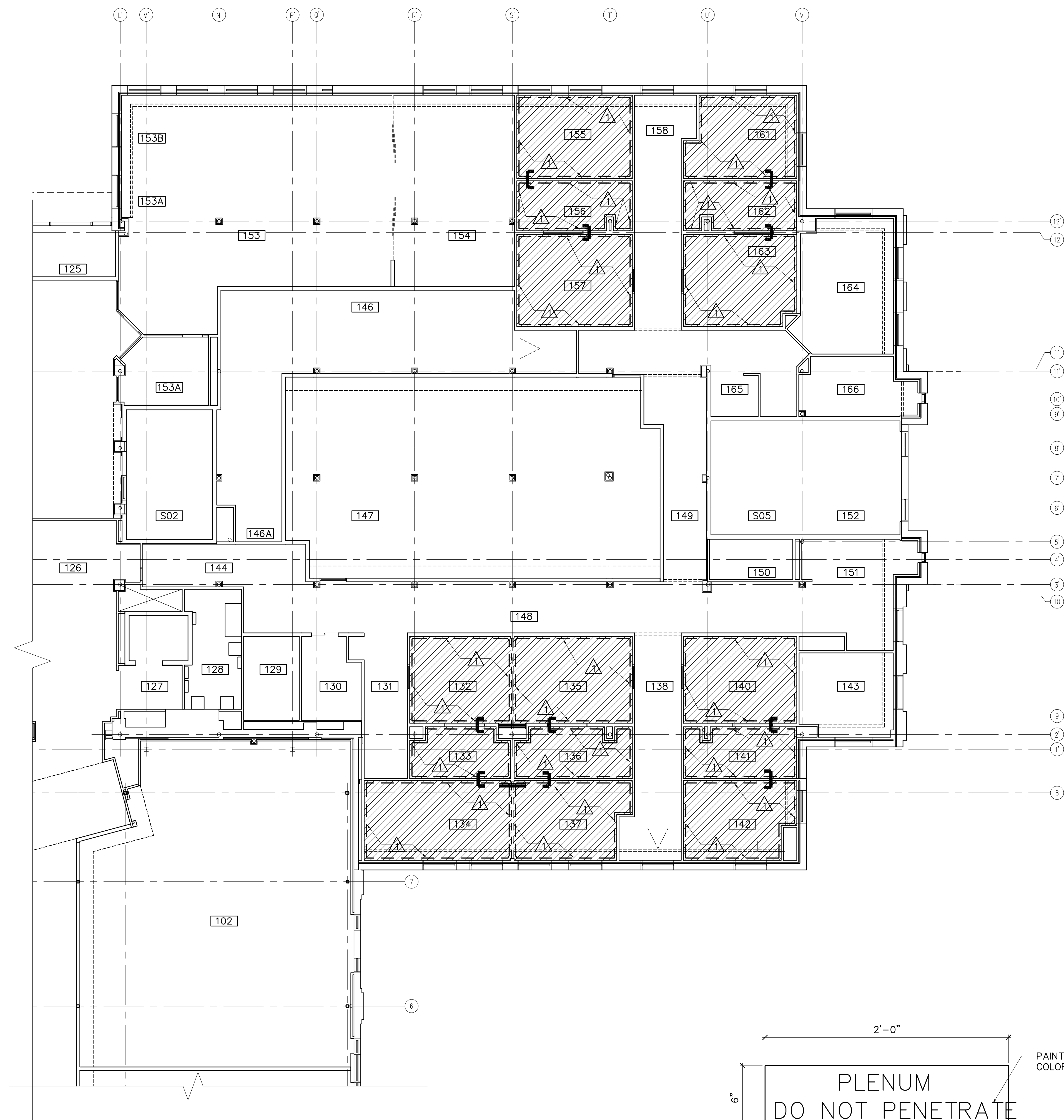
1 LOWER LEVEL FLOOR PLENUM PART PLAN AE710/ SCALE: 1/8"=1'-0" PLAN NORTH