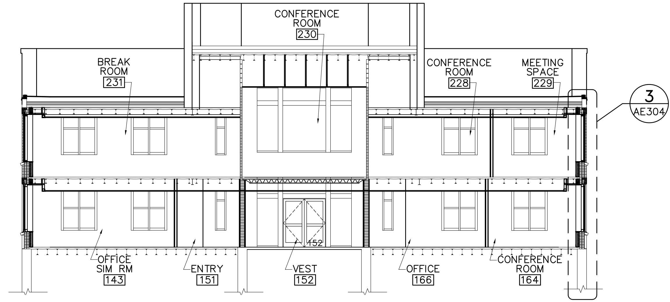
3 BUILDING SECTION AE101, AE102, AE221 SCALE: 1/8"=1'-0"