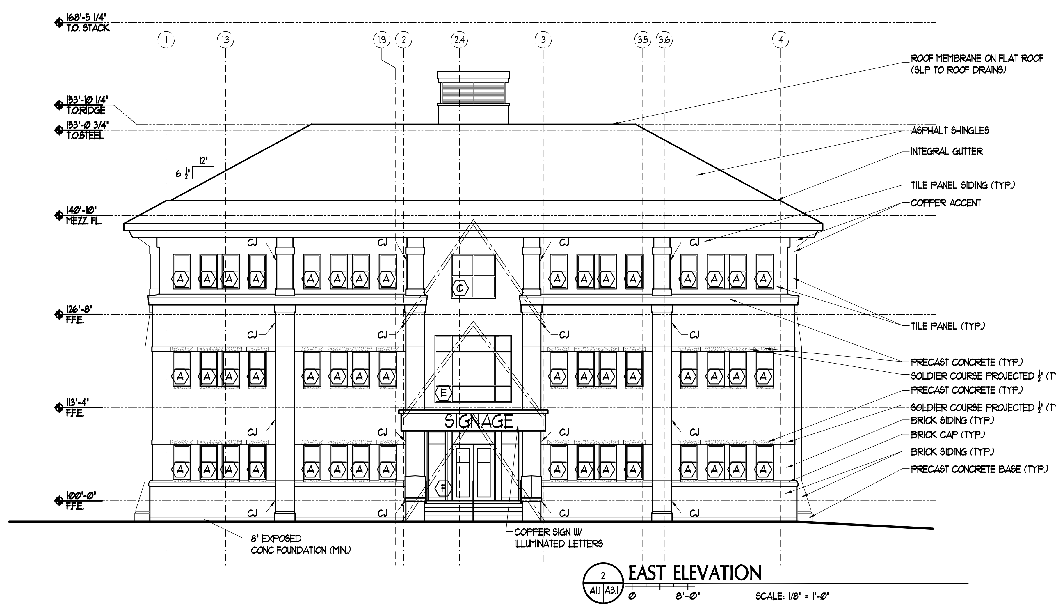
2 EAST ELEVATION