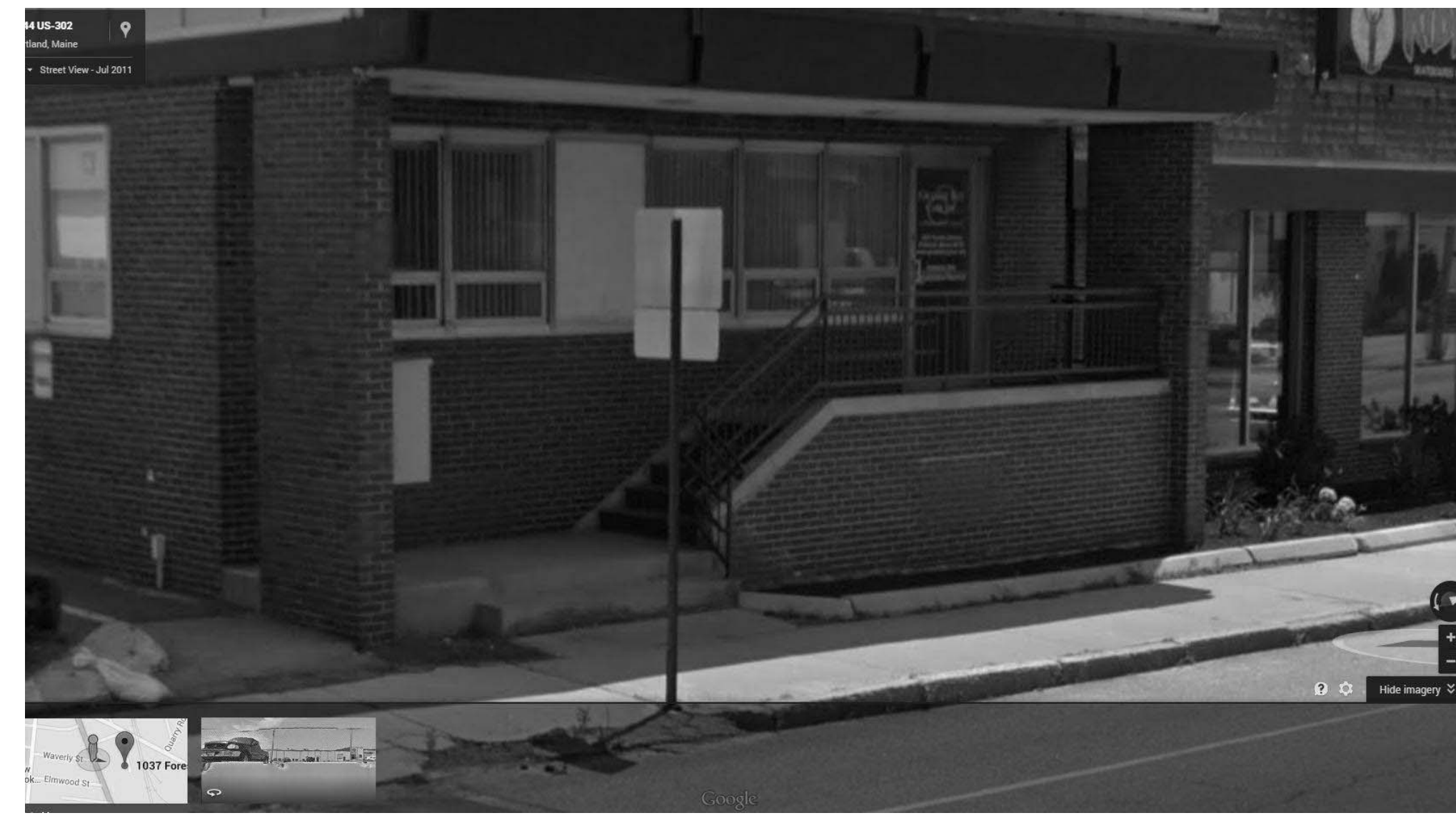
2 FOREST AVE ENTRANCE 1/2" = 1'-0"