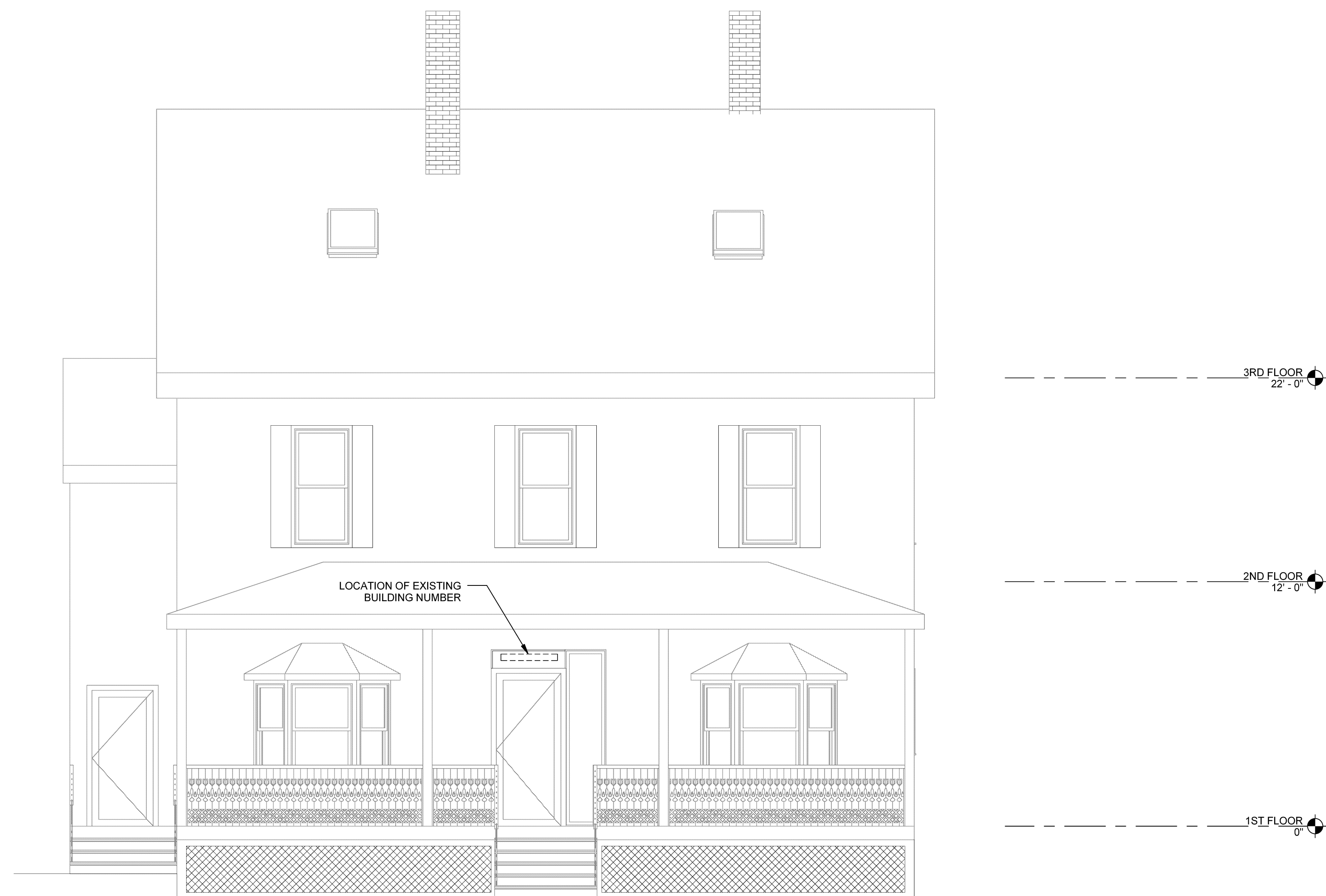
A1 FRONT ELEVATION SCALE: 1/4" = 1'-0"