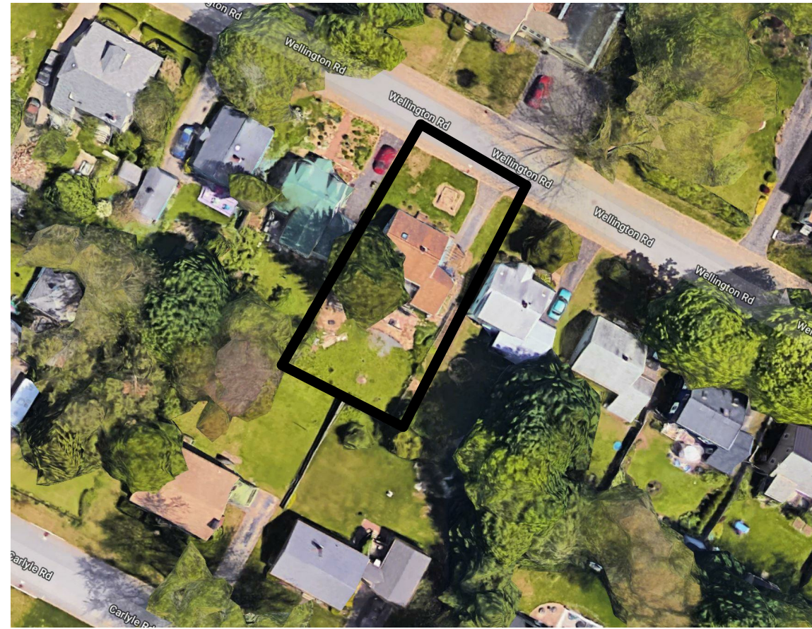
LOCUS MAP: 98 WELLINGTON STREET