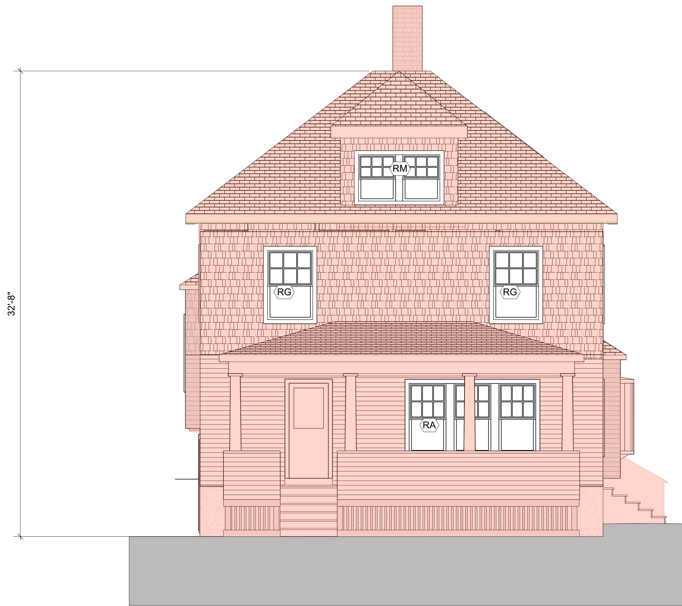
3 SOUTH ELEVATION Scale: 1/4" = 1'-0"