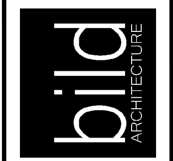
Bild Architecture PO Box 8235 Portland, ME 04104 207.408.0168 evan@bildarchitecture.com