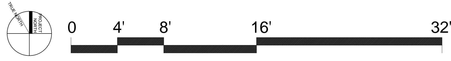
1 EQUIPMENT PLAN 1/4" = 1'-0"