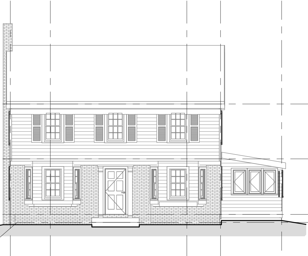
① FRONT ELEVATION 1/8" = 1'-0"

KW Architects Kristi Kenney, RA PO Box 404 Wells, Maine 04090 (207) 332-9199