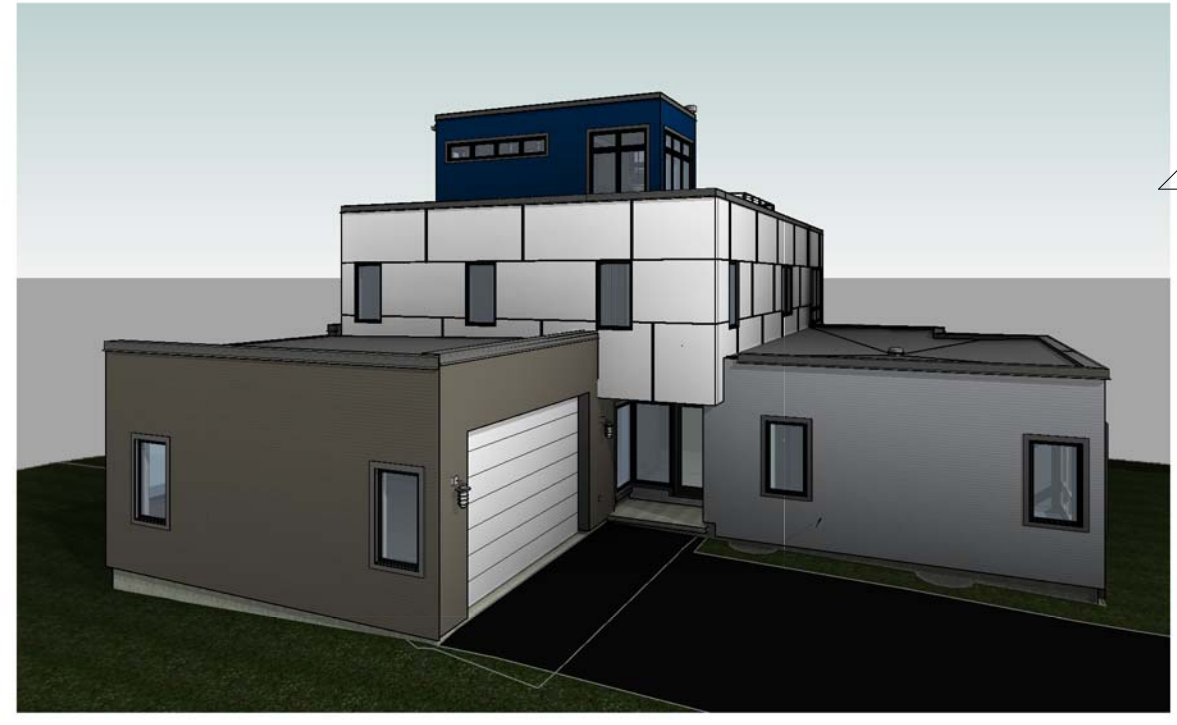
2 Exterior - Second Floor View