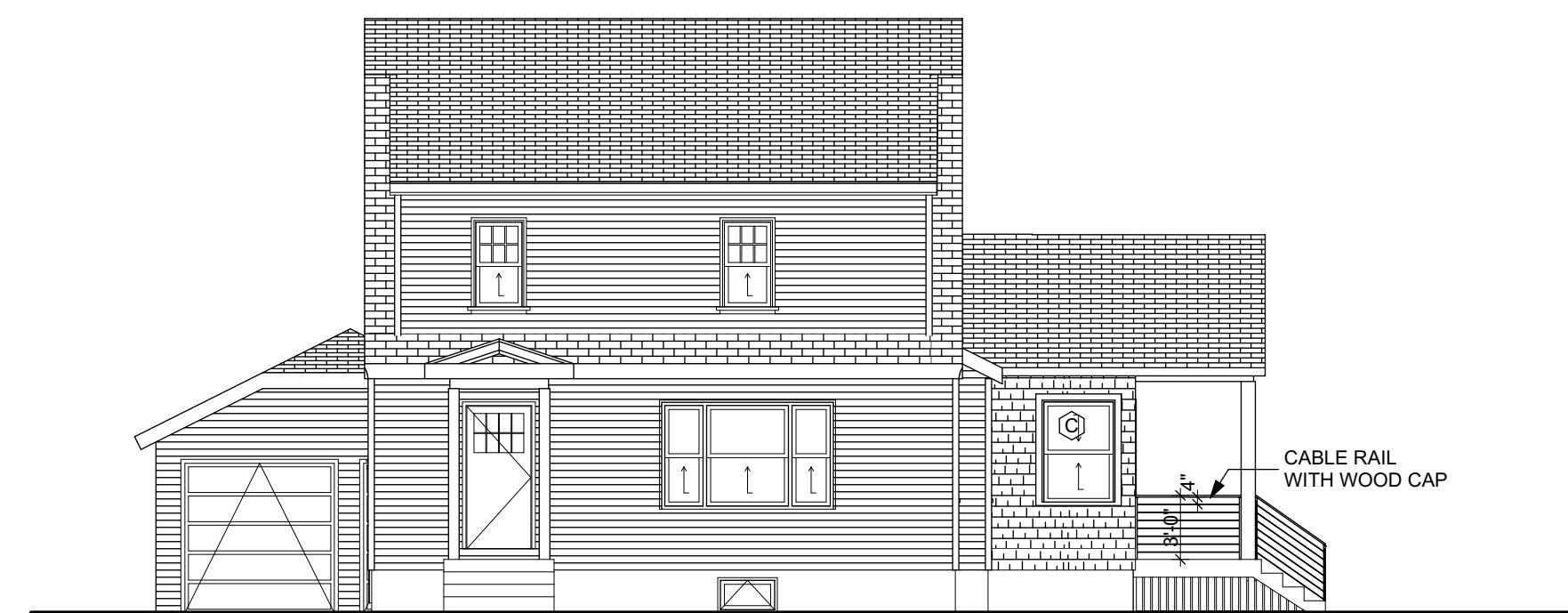
3 A2.1 SOUTHWEST ELEVATION SCALE: 1/8" = 1'-0"