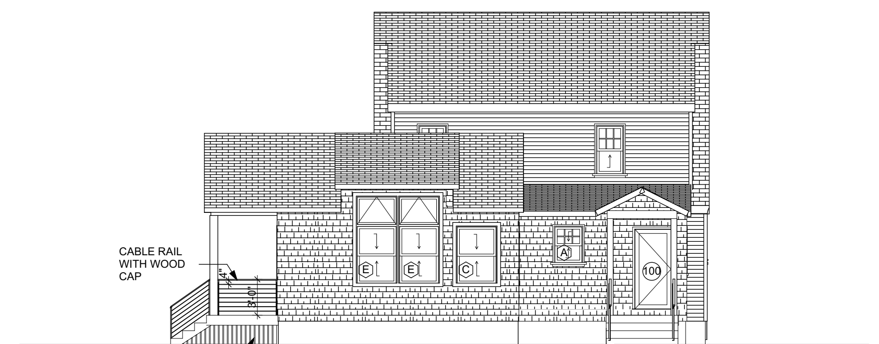
4 A2.1 NORTHEAST ELEVATION SCALE: 1/8" = 1'-0"

BROOKS STUDIO ADDITION PORTLAND, MAINE 64 MACKWORTH STREET