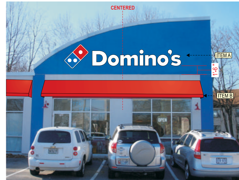
PROPOSED SIGN ELEVATION / SCALE 1/8"=1'-0"