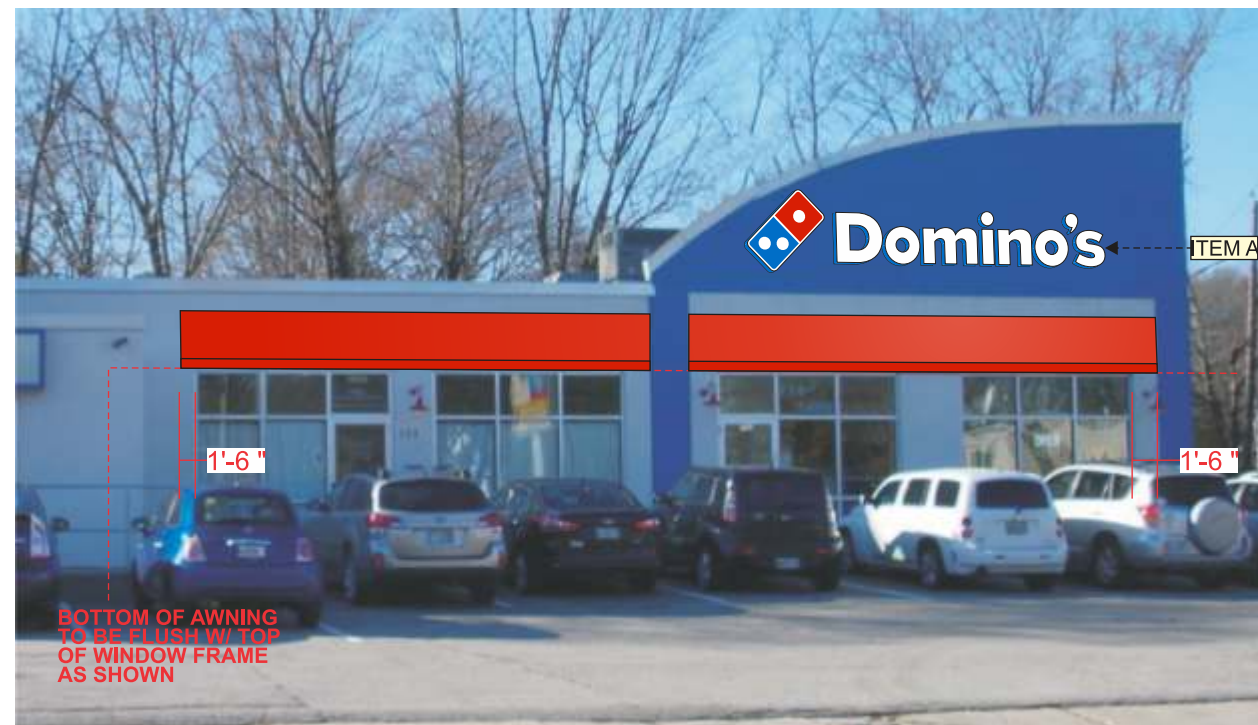
PROPOSED SIGN ELEVATION / SCALE 3/32"=1'-0"