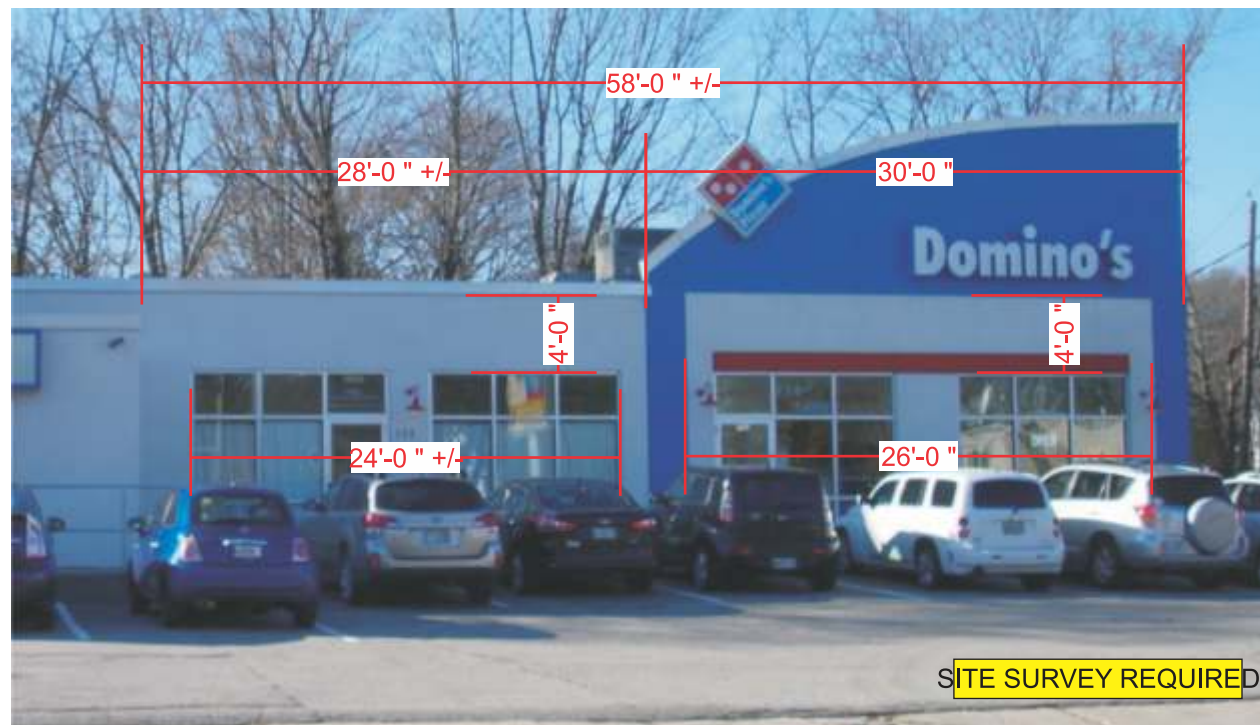
CURRENT SIGN ELEVATION / SCALE 3/32"=1'-0"