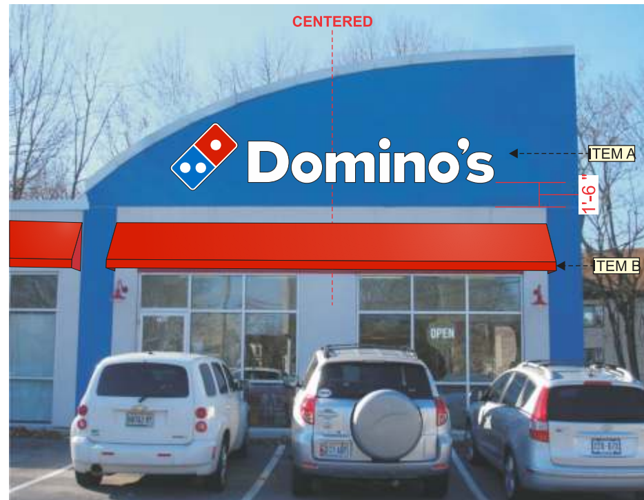
PROPOSED SIGN ELEVATION / SCALE 1/8"=1'-0"

Remove existing wall sign, 31.25 sf and 25 sf - 56 sf total install 45 sf. Tenant Space is 1.5 sf x 30'=45 SF allowed This Frontage (Forest)