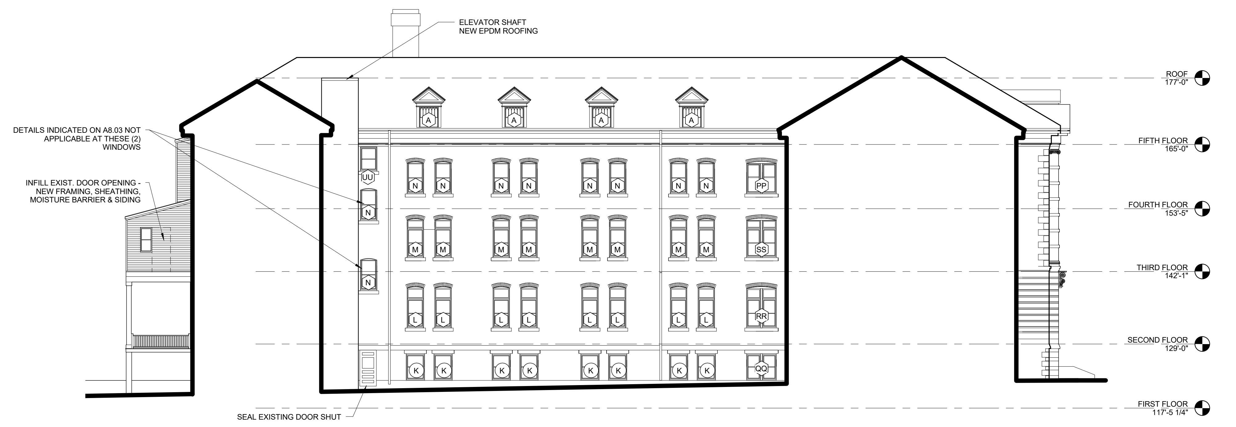
1 | NORTH ELEVATION AT SOUTH COURTYARD 3/32" = 1'-0"