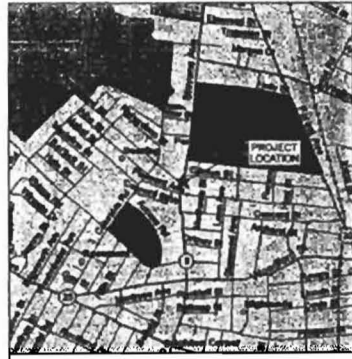
VICINITY MAP SCALE: 1" = 100'