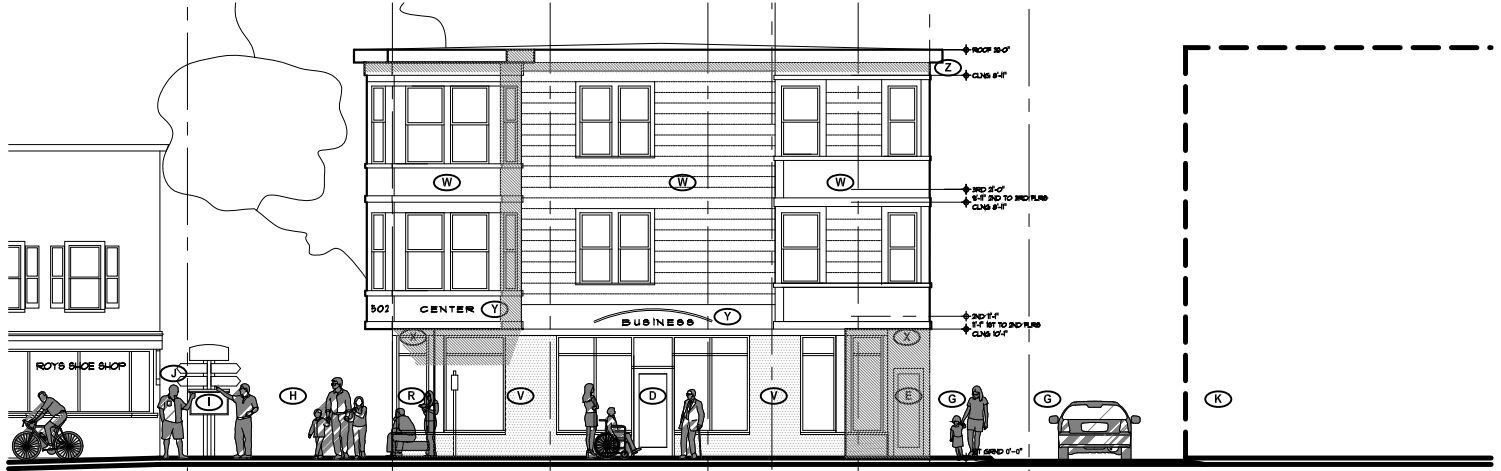
FRONT ELEVATION @ Stevens Ave