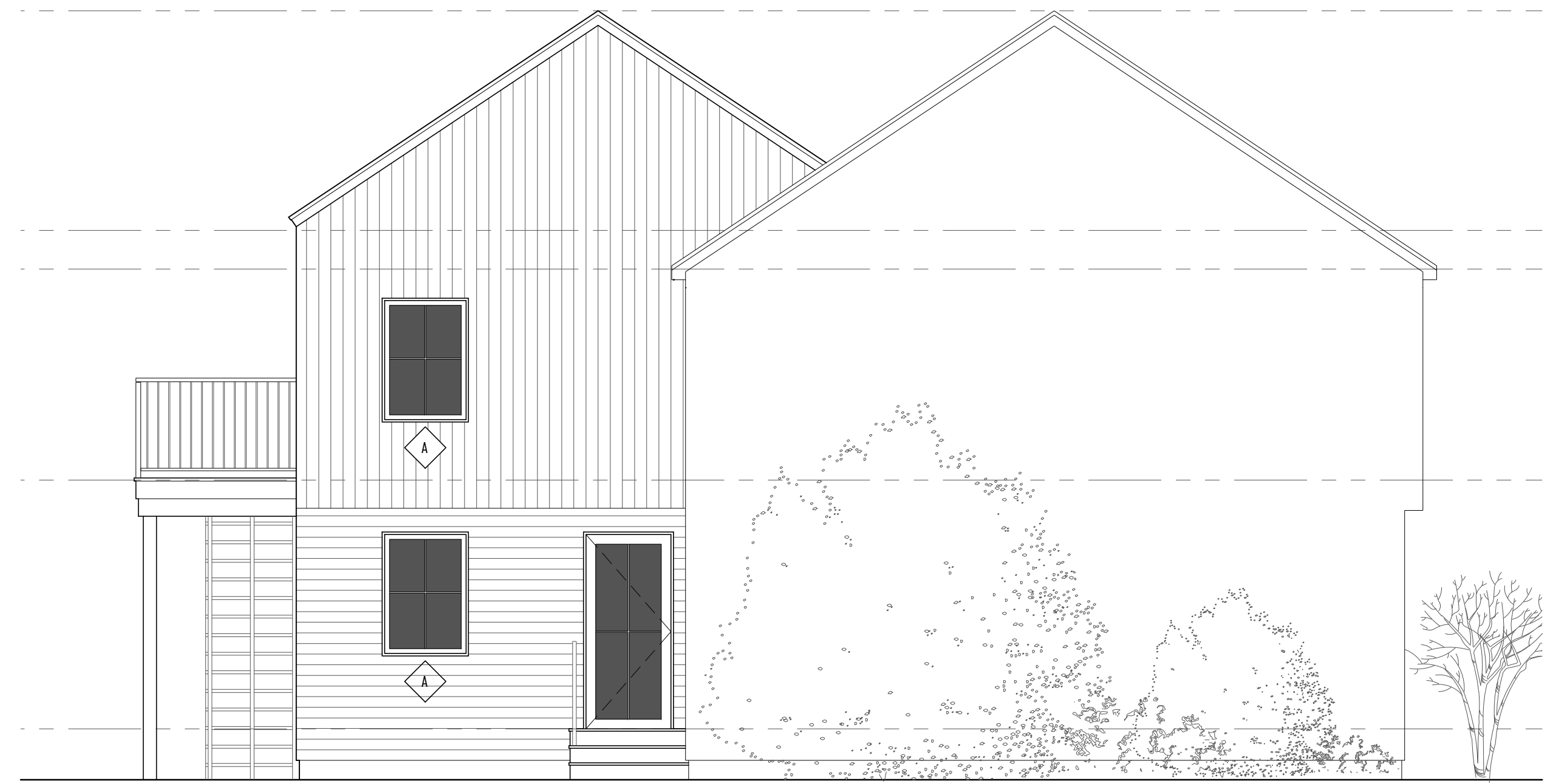
4 WEST ELEVATION SCALE: 1/4" = 1'-0"