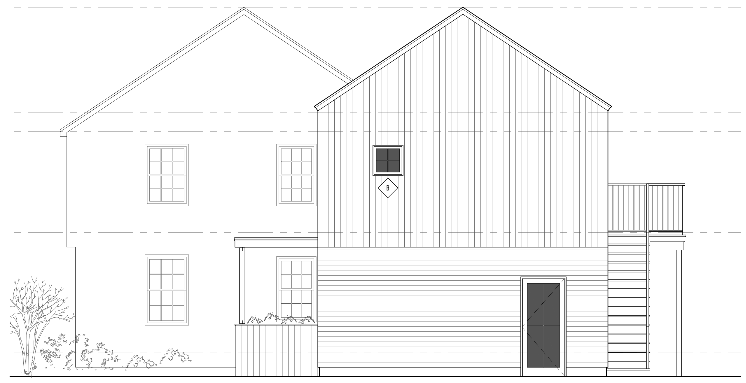
2 EAST ELEVATION SCALE: 1/4" = 1'-0"