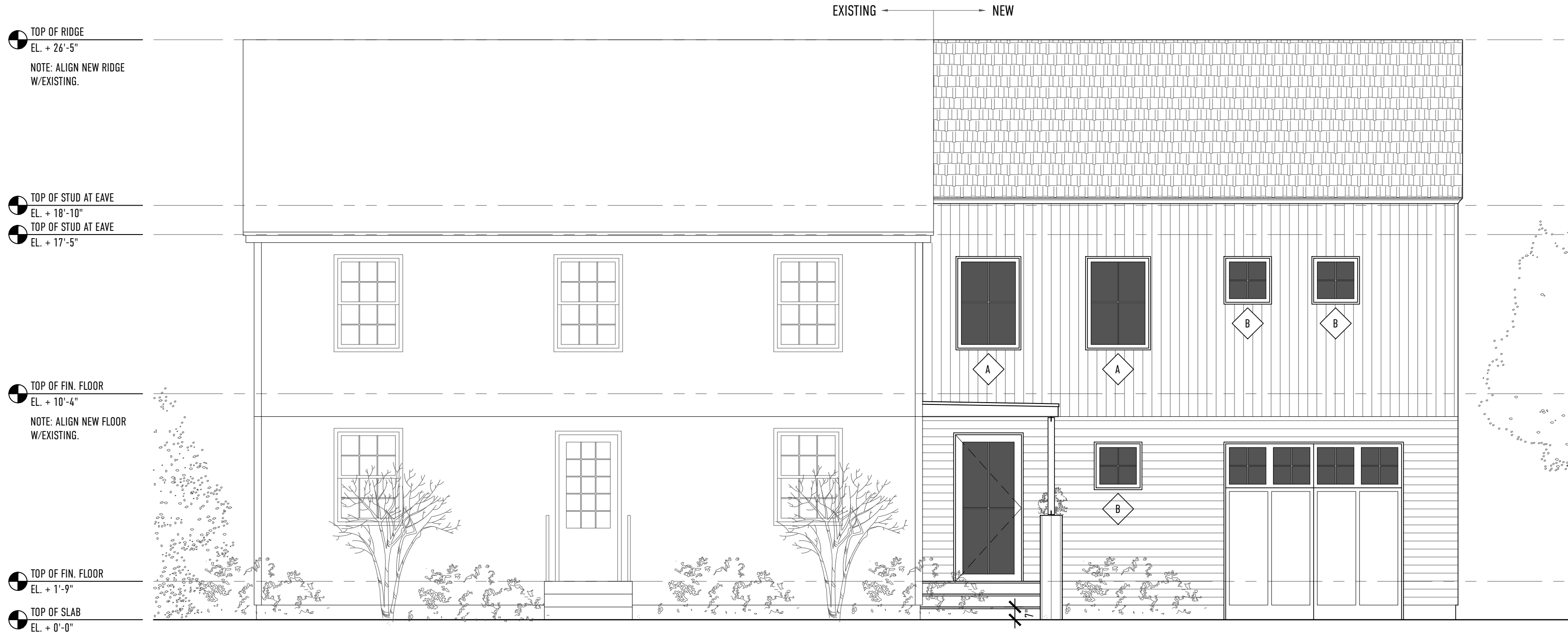
3 SOUTH ELEVATION SCALE: 1/4" = 1'-0"