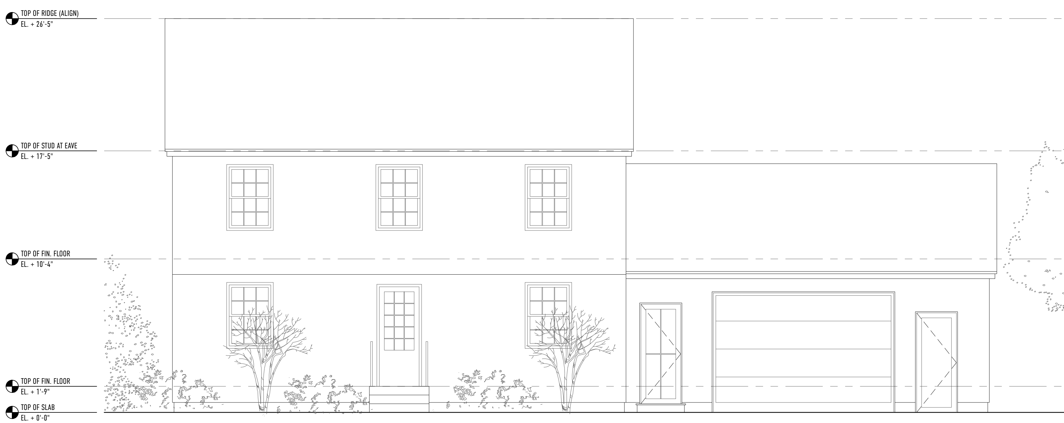
3 SOUTH ELEVATION SCALE: 1/4" = 1'-0" 0 2 4 6