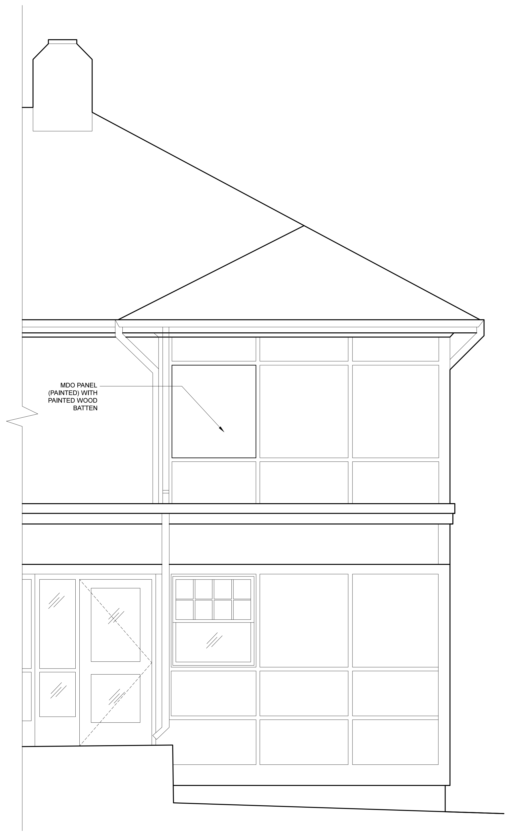
2 Exterior Elevation SCALE: 1/2" = 1'-0"

LDD PROJECT NAME: N/A DRAWING NAME: FIELD BOOK USED: N/A